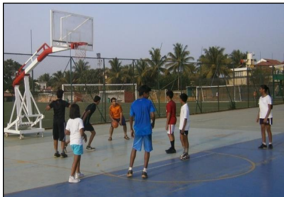
Students on the basketball court