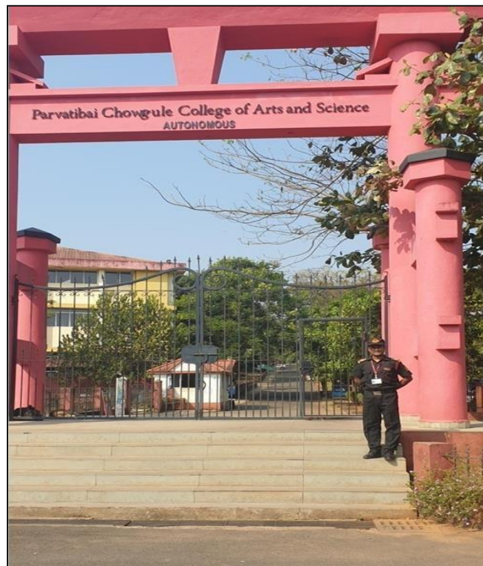
Security guards at the entrance of campus