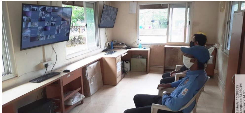
Continuous monitoring of the campus via CCTV in the security control room