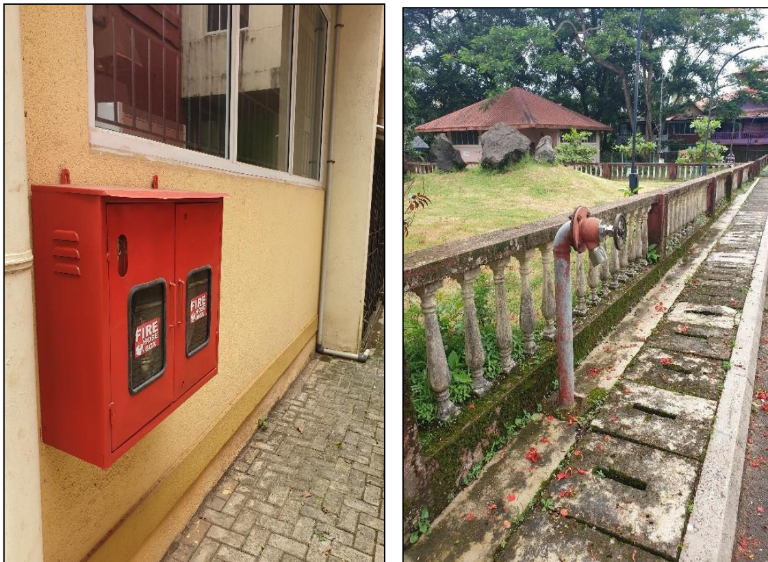
Fire hose box placed outside the Quad area in A-block and water facility

The institution has Disaster Management committee for handling emergency situation and mock fire drills and workshops are conducted periodically for all students and staff.