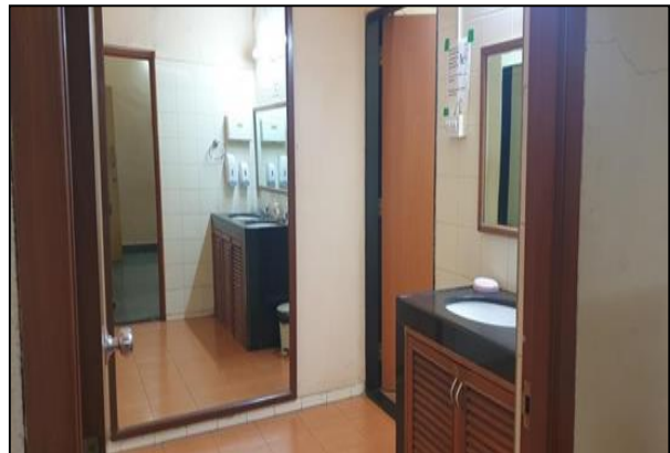
Common room for Ladies on campus