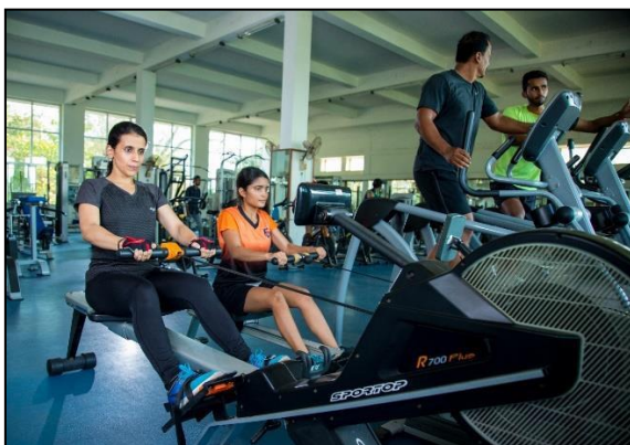
Students and staff availing gymnasium facility