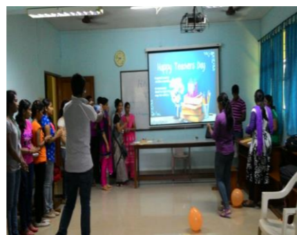
Teachers Day Celebration