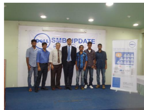
SMB Technology Update @ Goa GCCI Hall Panjim