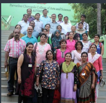
ICT based teaching-learning