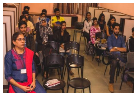
Visit to Tiger's Studio by TYBSC Students