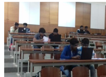
Participants busy solving the problem at Hackathon