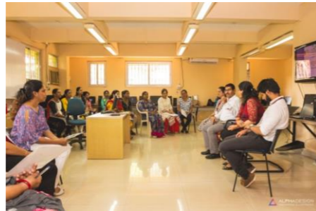
Interactive Q& A Session

given sessions on “ ICT in Education ” and also provided with hands on training on FOSS tools like GIMP, Audacity, Open Shot, etc. They were also given a CD containing various FOSS softwares. The Workshop had 23 teacher participants from around 11 Schools/HSS participated in this workshop.