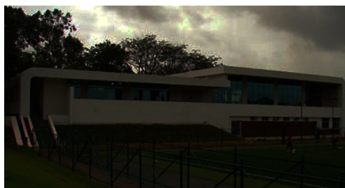
what lurks after hours here?