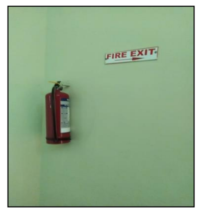
Fire extinguishers placed near Biotechnology laboratory, Studio and D-Block