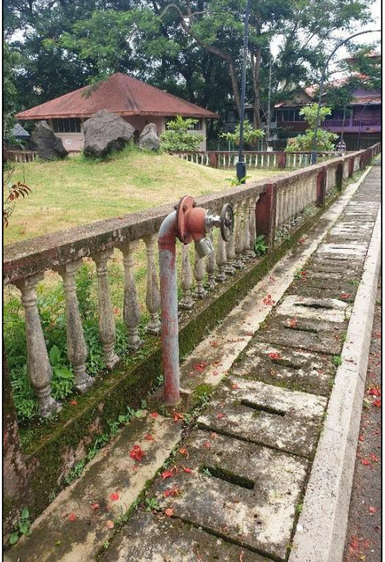
Fire hose box placed outside the Quad area in A-block and water facility

The institution has Disaster Management committee for handling emergency situation and mock fire drills and workshops are conducted periodically for all students and staff.