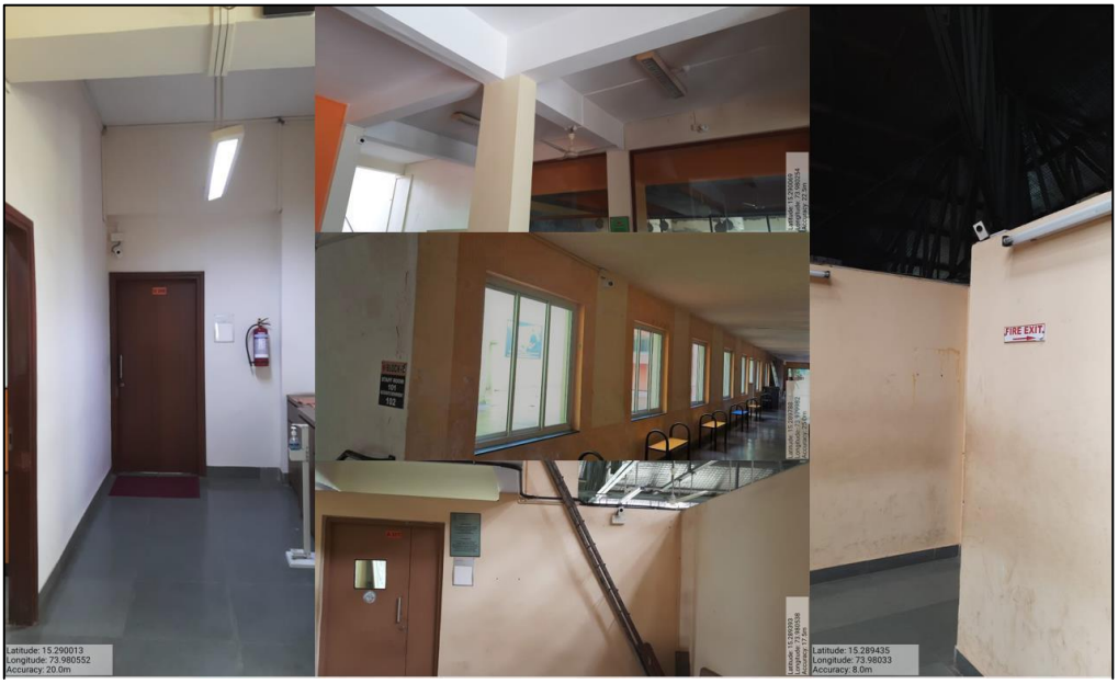
Round the clock surveillance system with CCTV cameras installed at various location in the campus