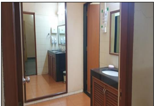
Common room for Ladies on campus