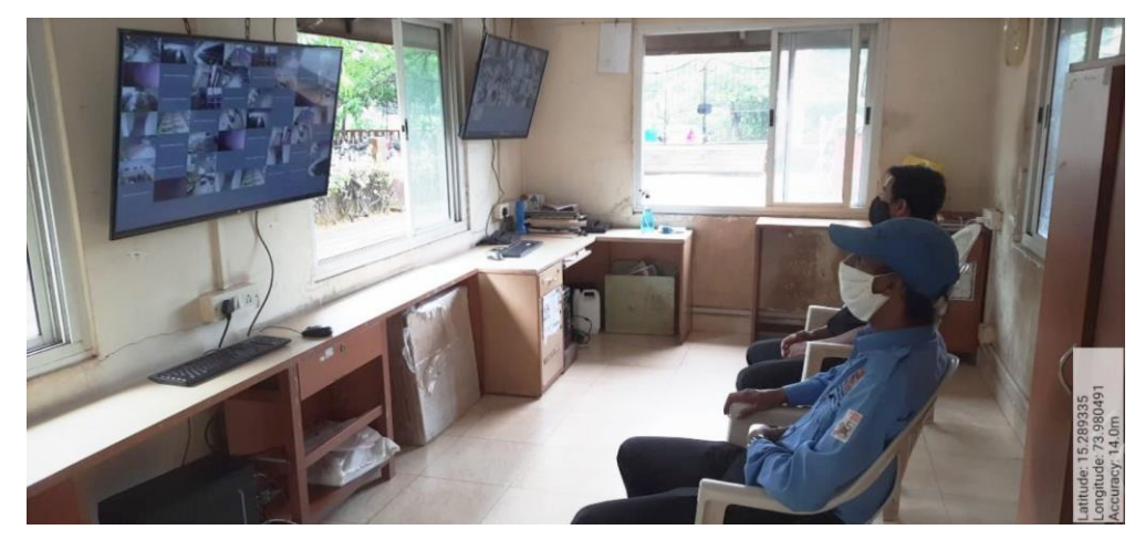
Continuous monitoring of the campus via CCTV in the security control room