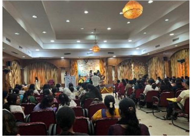
Students along with the faculty attending the programme on 'Nirbhay Bharat-Sashakt Nari'