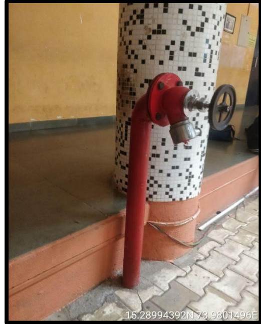
Fire hose box placed outside the Quad area in A-block and water facility