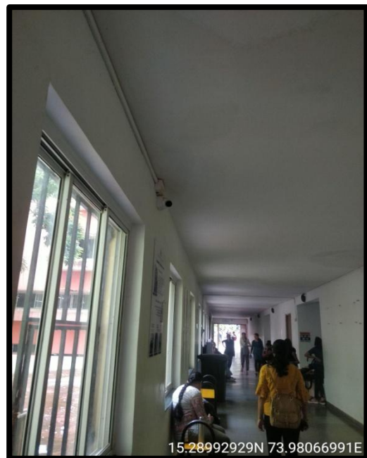
CCTV cameras installed in the campus