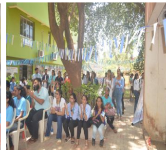
Coordinator at Sangath