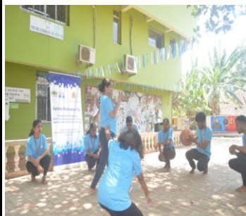
Street Play Performance by Kare College students