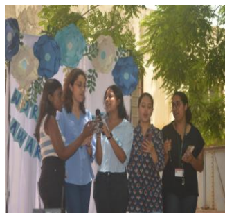
Song Performance by Psychology students