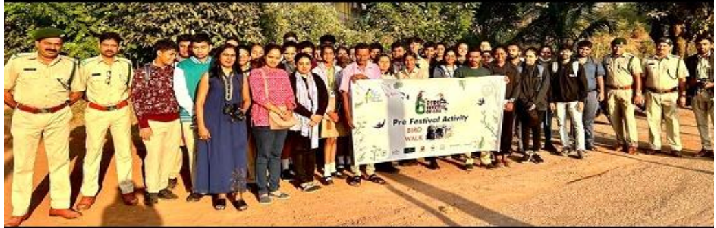
DAY 1 – 11 TH JANUARY 2023- BIRD WALK ORGANISED FOR MANOVIKAS ENGLISH MEDIUM SCHOOL FATORDA GOA