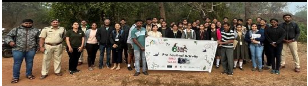
DAY 4 – 14 TH JANUARY 2023- BIRD WALK ORGANISED FOR VIDYA VIKAS ACADEMY, COMBA MARGAO

Prepared and Approved by Department of Zoology