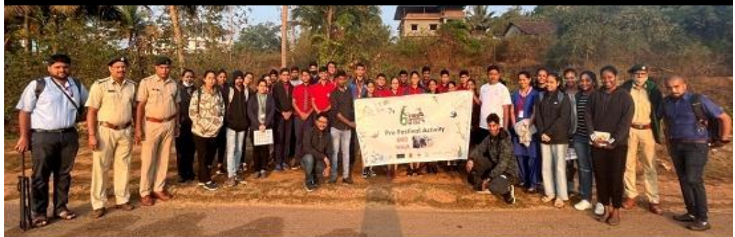
DAY 3 – 13 TH JANUARY 2023- BIRD WALK ORGANISED FOR THE KINGS SCHOOL SAO JOSE DE AREAL MARGAO GOA