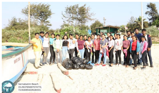
Post beach cleanup