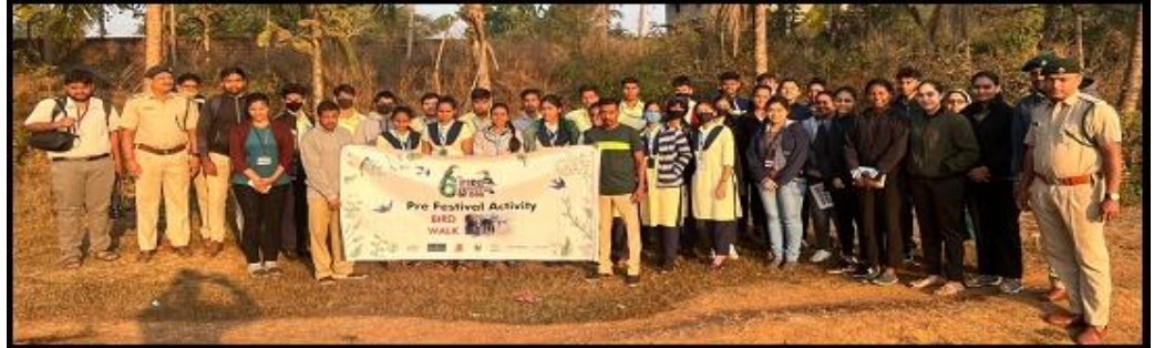
DAY 2 – 12 TH JANUARY 2023- BIRD WALK ORGANISED FOR MULTIPURPOSE HIGHER SECONDARY SCHOOL