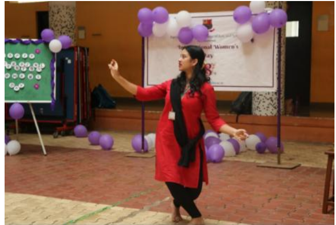
Dance performance by student at the International Women's Days