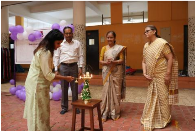
Faculty lighting the lamp along with dignitaries at the Inaugural Function of International Women's Days

for Poster Competition on the topic 'Diet for Women' at the International Women's Day