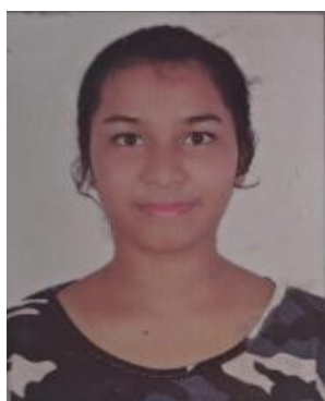
1 st Place