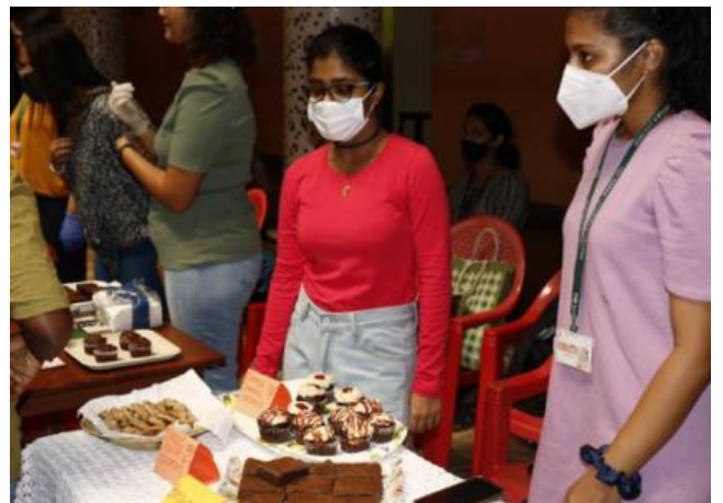
Bazaar Day Stalls at the International Women's Days