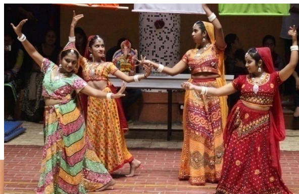
Group of College students performing dance on cultural day