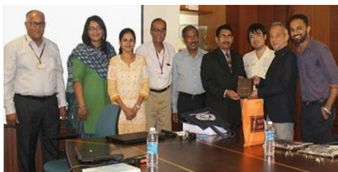
Principal giving memento to the faculty from Kansai University, Osaka, Japan in our College