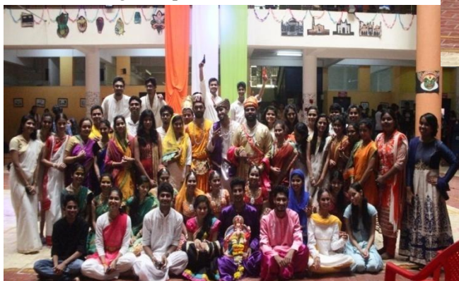
All the participating students on Cultural day organized by the Cultural Club