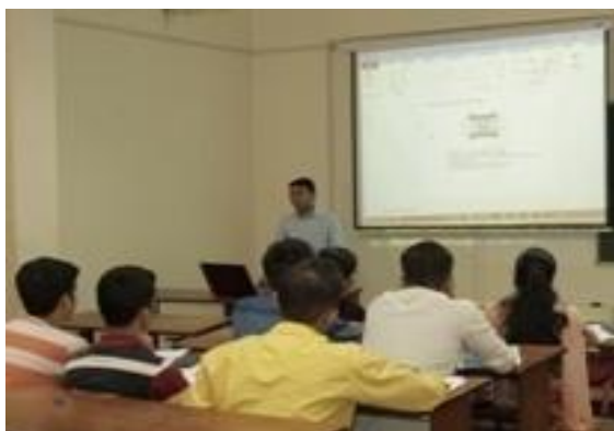
Workshop on “Experimental Physics” for physics students