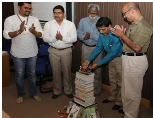
Principal along with Konkani department faculties and Chief Guest is inaugurating at the State Level Seminar on 1 व्याशेकड्यांतले गोंयचें कोंकणी-मराठीसाहित्य: स्वरूपआनीसमिक्षा”