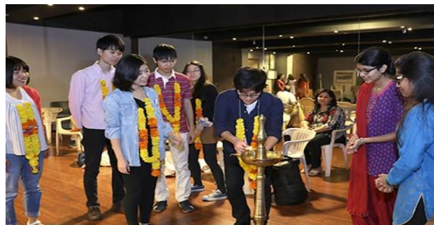
Japanese students lighting the lamp in our college under Student Exchange program.