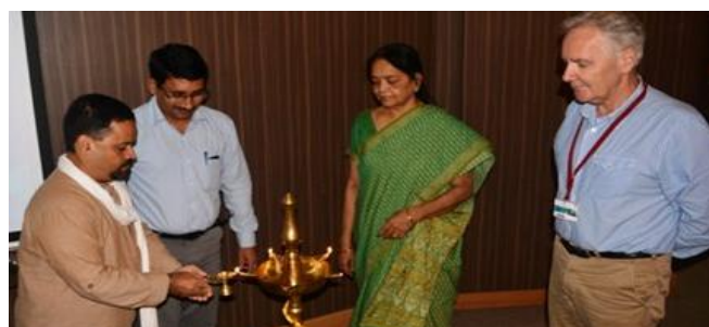
National Level Seminar on "The Writing Centre: An Instrument to Improve the Writing Skills of Students"