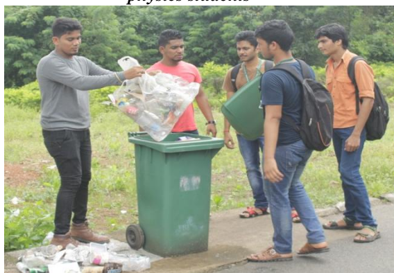
Students throwing plastic items collected from the college campus in the dustbin.