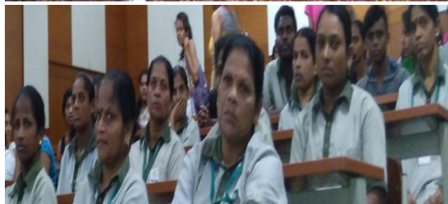
Workshop cum interactive session on "Hygiene and Cleanliness Strategies" for janitors karmacharis