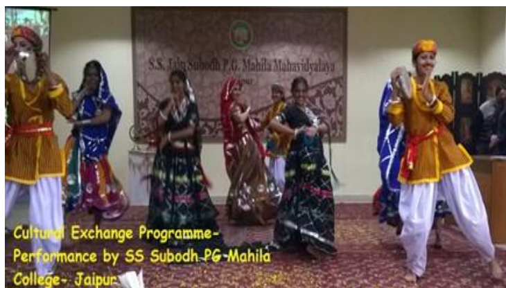
Cultural Exchange Programme- Performance by SS Subodh PG-Mahila College- Jaipur