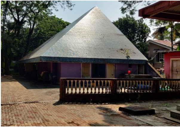
Canteen – Outside View