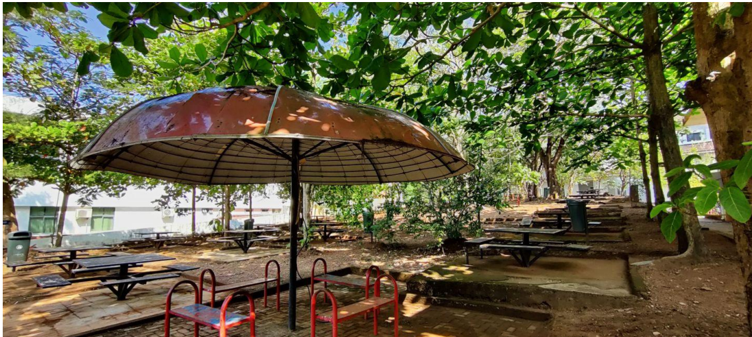
Activity Court (Open Space sit-out)