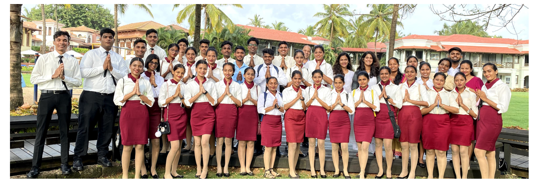
The Programme duration is One year which involves 8 months of classroom Sessions, 4 months of Practical training, Industry Exposure, and Community Engagement.

The programme in Aviation, Hospitality & Customer Service is certified by Parvatibai Chowgule College and prepares the leaners for an exciting and satisfying career in the Aviation, Hospitality & Travel Industry. After completion of the highly elaborate and intensive training period of one year, the students are ready seize opportunities around the globe