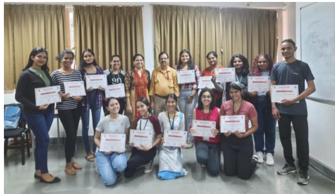
Participants of the CCRM 2022