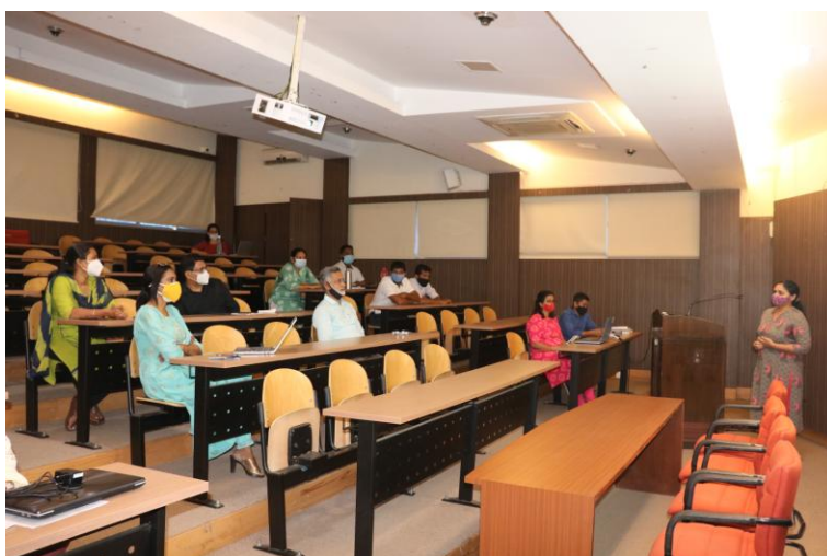
Faculty presenting to the attendees at the Positive Chowgules