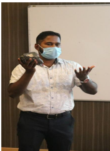
Faculty members presenting their best practice at the Positive Chowgules