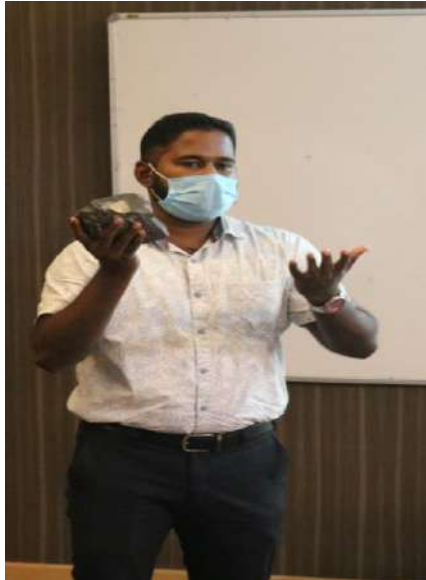
Faculty members presenting their best practice at the Positive Chowgules