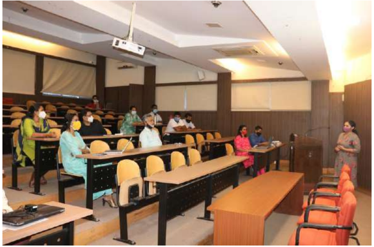
Faculty presenting to the attendees at the Positive Chowgules