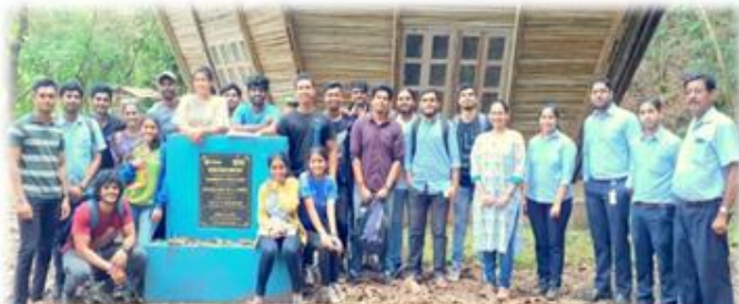
Batch 2018-19- Field Visits to the Sanquelim Mine

Formerly known as Sesa Goa, Vedanta Limited is a part of Vedanta Group company which is engaged in exploration, mining and processing of iron ore.