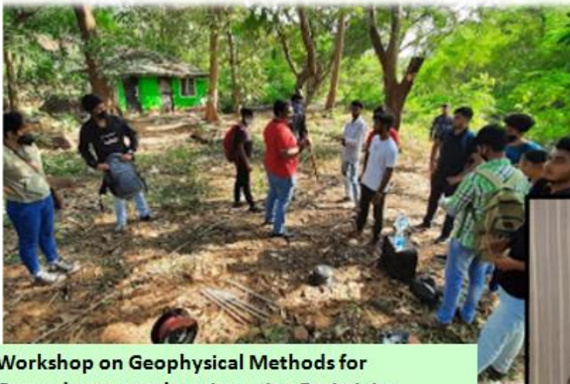
Workshop on Geophysical Methods for Groundwater exploration using Resistivity Method

Consultant for Geophysical Survey, Ground Water Management and Rain Water Harvesting.