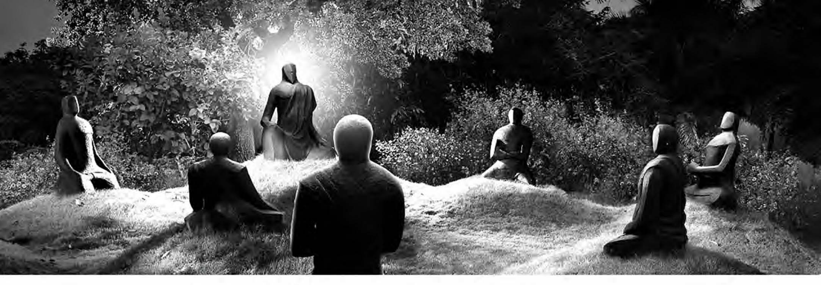
Chowgule Education Society's