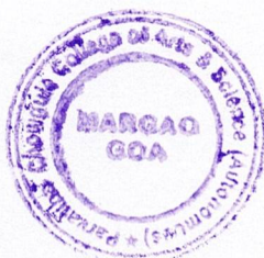
PRINCIPAL PARVATIBAI CHOWGULE COLLEGE OF ARTS & SCIENCE (AUTONOMOUS) MARGAO-GOA