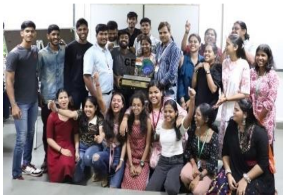
Winners- 'GEO-INDIA 3.0' Government College, Khandola