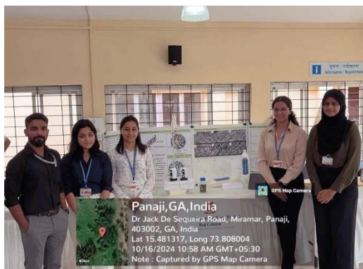
Students and faculty for the National Youth Festival

They have been selected as one of the top 10 teams that will represent the State of Goa at the National Level Competition from 12 th to 16 th January, 2025.