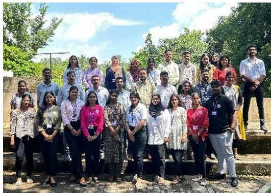
Elected committee of GLOBE