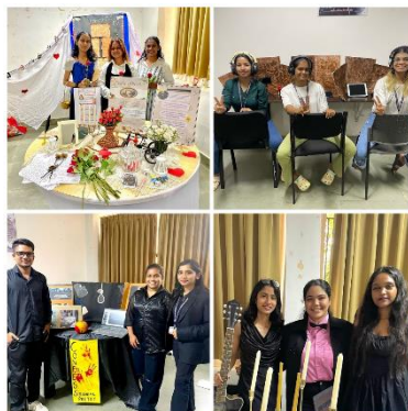
A glimpse of the 'Gallery Walk'