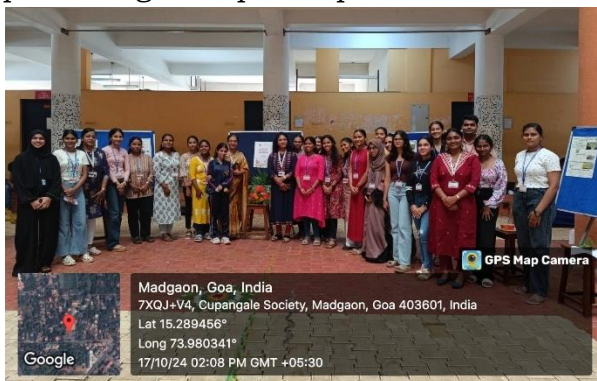
Participants of the event ' The Nature Unleashed: Fun with wild flora '

Participants learned about the ecological and economic significance of wild flora. They explored the use of local plants in homemade dishes, promoting sustainable cooking practices, increased recognition of the importance of preserving local plant species and their habitats.