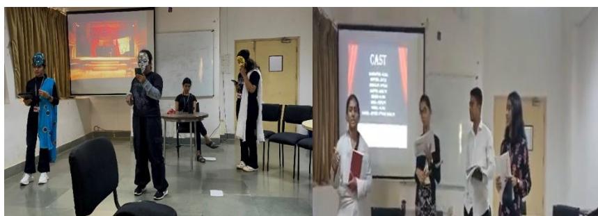
Students enacting different characters