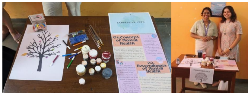
Stall setup by the Third-Year students for expressing emotions using art

The postgraduate Department in Psychology organized the following activities.