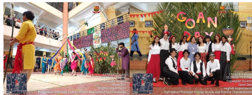
A glimpse of the 'Goan Day'