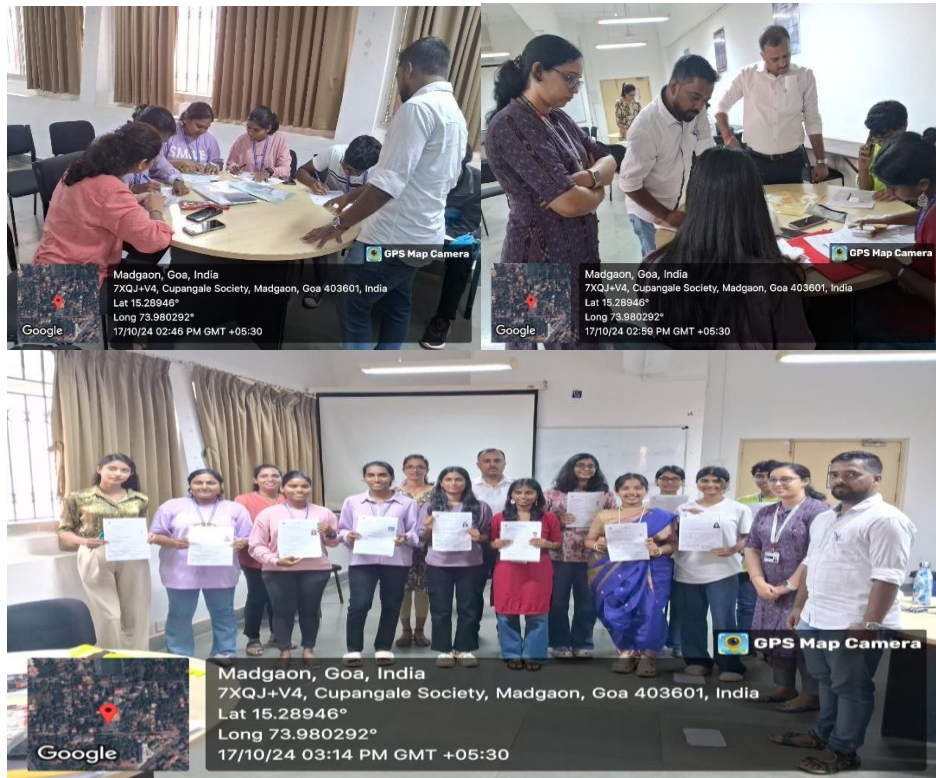
A glimpse of the 'Voter Registration Camp'

Electoral Literacy Club of the College in collaboration with AERO and ERO of 30- Fatorda AC organized a 'Voter Registration Camp' on 17 th October, 2024. The camp was organized for the purpose of increasing enrolment of voters in the age group of 18 years and above. 14 students, 2 faculty members and 2 external members attended the camp.