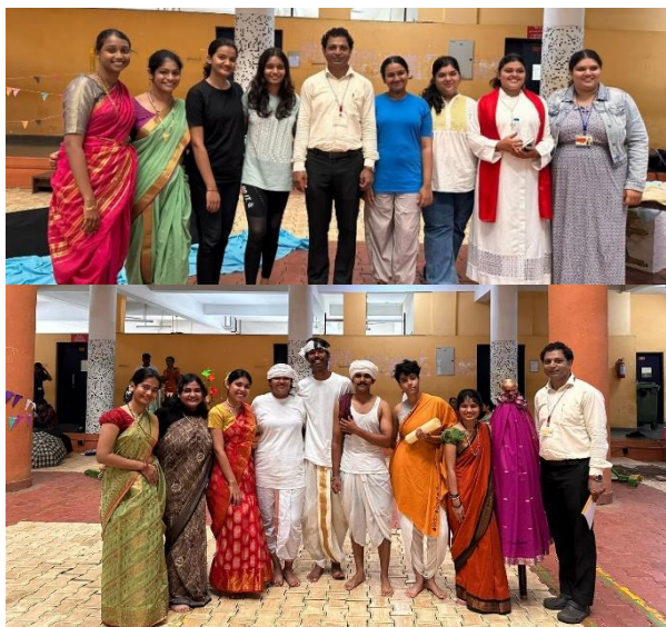
Students recreating various aspects of Goan culture through demonstration