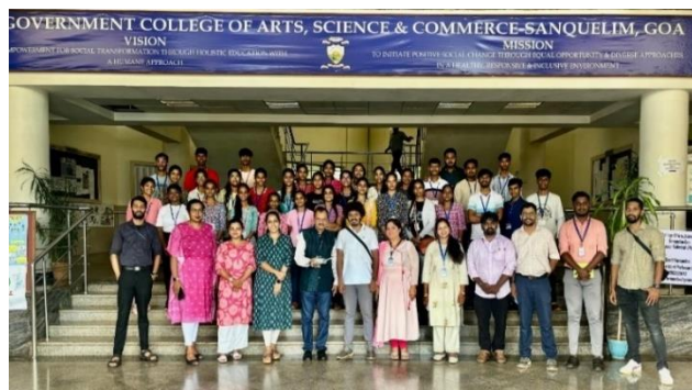
Students for the 'Exploring Earth from a Bird's Eye: Drone Workshop'