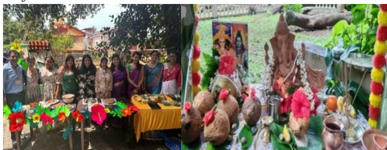
A glimpse of the food stalls