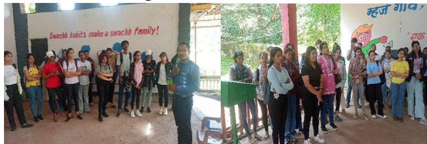
Interaction with the member of a Village Co-operative society