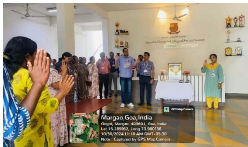
Staff members taking the ‘Rashtriya Ekta Diwas’ Pledge

On the occasion of Birth Anniversary of Sardar Vallabhbhai Patel, National Unity Day was observed in College on 30 th October, 2024 by administering the ‘Rashtriya Ekta Diwas’ Pledge. All the non-teaching staff attended the same.