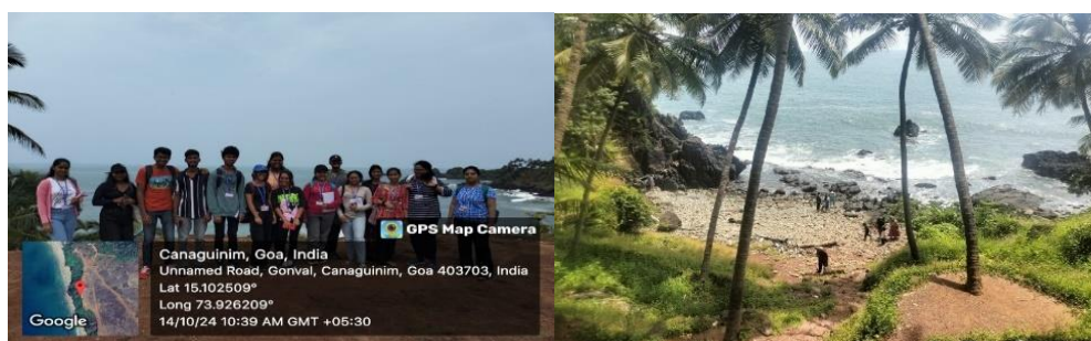
Students for the 'field trip' to Cabo de Rama, Canacona