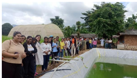
Students and faculty at an Agricultural Farm having an immersive filed experience