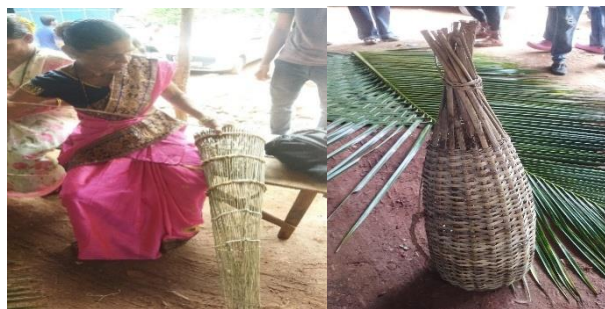
Depiction of the Traditional occupation