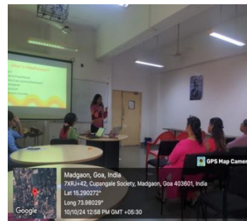
Session on 'Mindfulness and Stress management' by Alumni for non-teaching staff