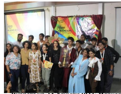
Runners up - St. Xavier's HSSC, Mapusa The Shakespeare Festival