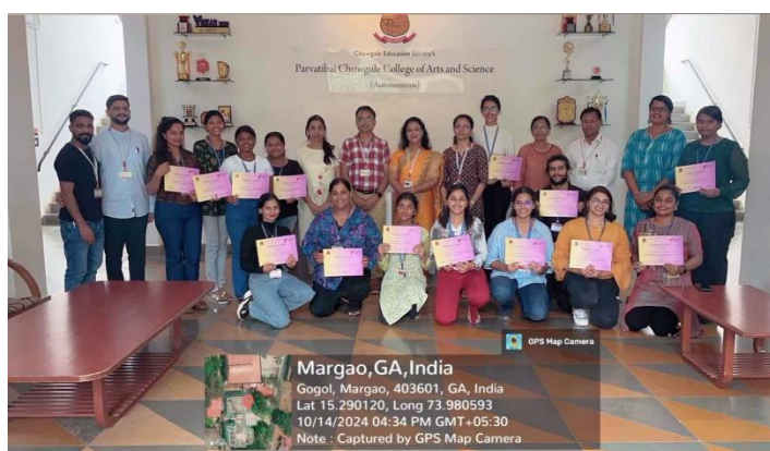
Winners of Inter-Departmental Competition on 'Ideation'