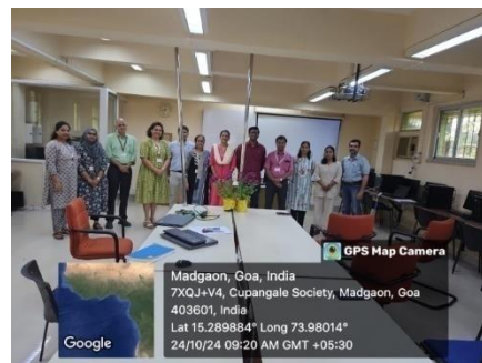
Faculty members along with the resource persons