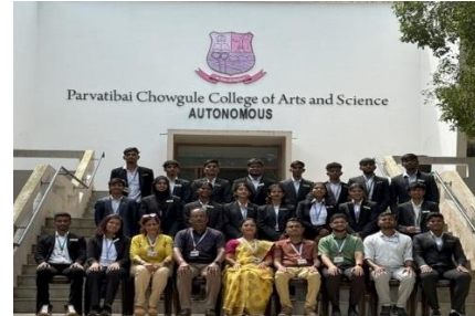
“Advitiya Netrutva” Student Sports Leadership Group 2024-25