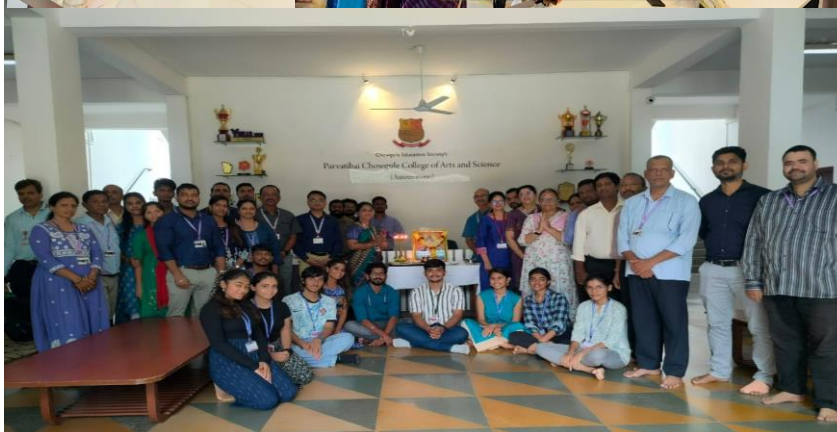
A glimpse of the Shree Devi Saraswati Puja