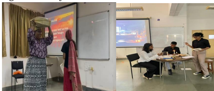
A glimpse of the activity 'Women in Dialogue'