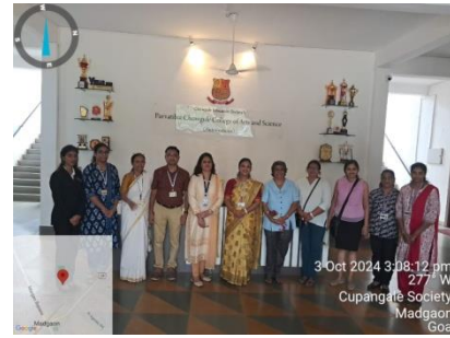
Internal Committee members along with the resource person