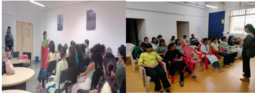
Session conducted on 'Stress management & Psychological flexibility' by alumni for students