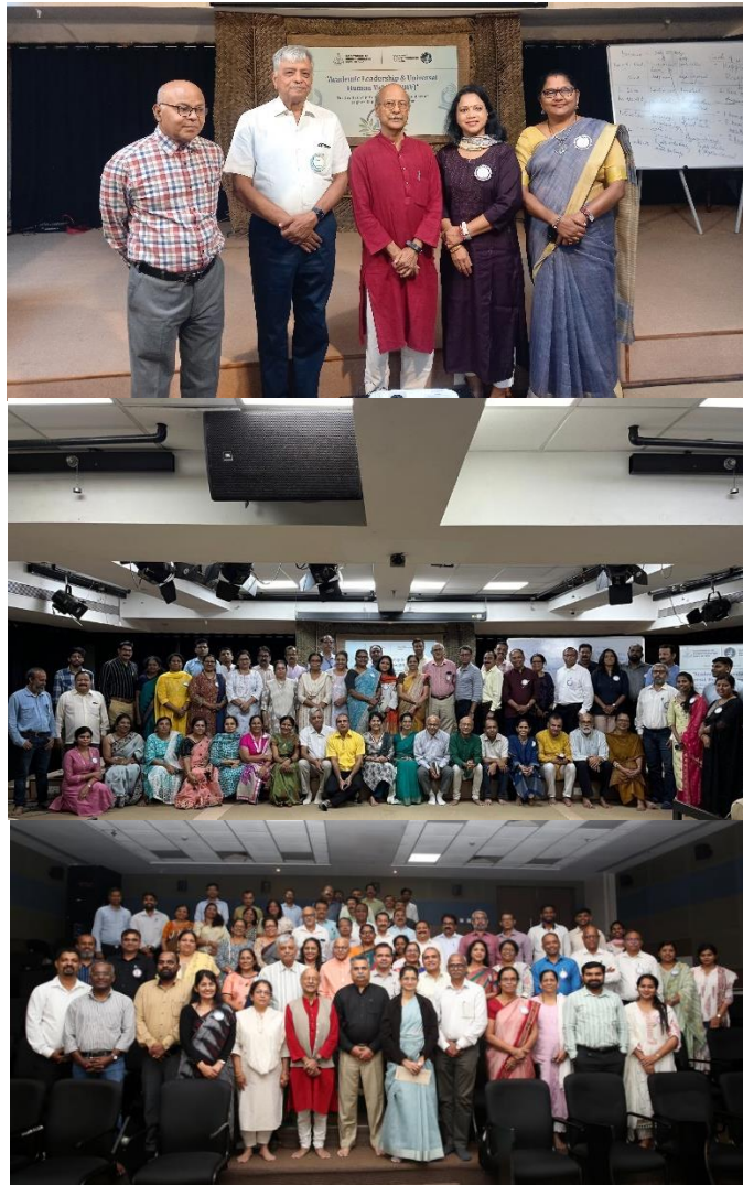
Principal for the four days' workshop on 'Academic Leadership & Universal Human Values (UHV)'

The workshop focused the importance of human values to be inculcated in academic institutions involving relationships & culture, team building and effective dialogue.