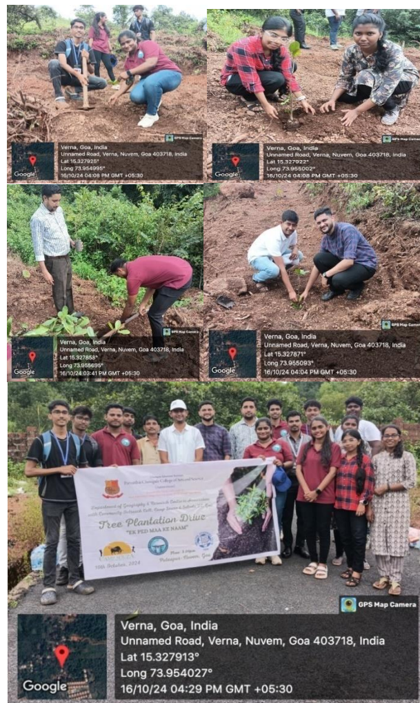
Students and Faculty planting saplings at Pateapur-Nuven, Goa

The plantation drive focused on the theme “ Ek Ped Maa ke Naam ” during which a total of 50 saplings were planted by faculty and students of Geography and “ Advitiya Netrutva ”-Students’ Leadership Group of the College.