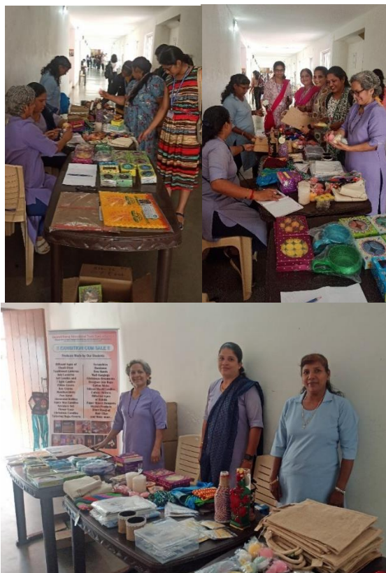
A glimpse of the fund-raising activity with the Gujarathi Samaj School for Differently Abled

The highlight of the event was the sale of unique products handcrafted by the children from the Gujarathi Samaj School, intended for Diwali celebrations. These items, thoughtfully displayed in the college corridor, included festive decor and gift items, showcasing the children's creativity and efforts.