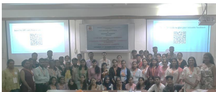
Participants along with the resource persons