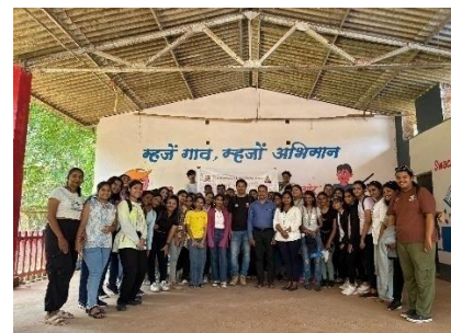
Students and Faculty at the Co-operative Society