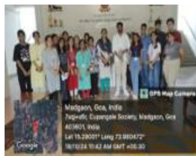
Participants along with the resource person