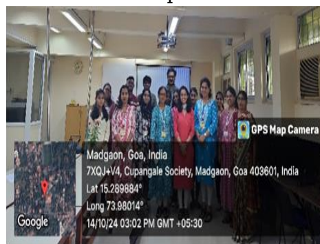
Participants along with the resource person