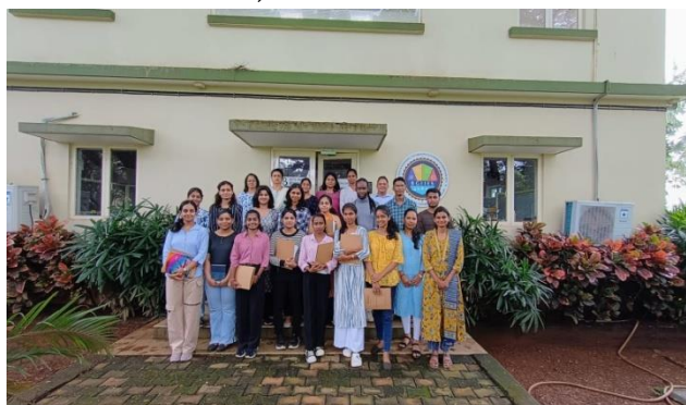
Students for the workshop on 'Cell culture technology and 3D Bioprinting'