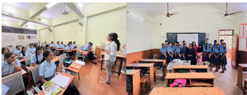
Students visiting different HSS

benefits. The visits were scheduled between 6 th September to 6 th October 2024 with prior permission from the schools.