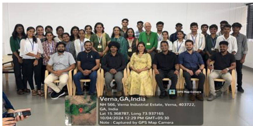
Students and faculty for the industrial visit at Creative Capsule, Verna