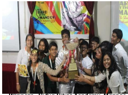
Winners – Vidya Vikas Academy, Margao The Shakespeare Festival