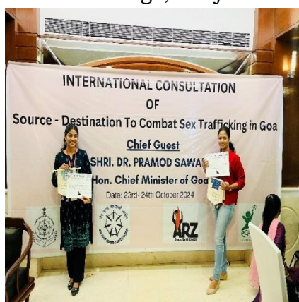
Faculty for the two days International Consultation Combatting Sex Trafficking in Goa