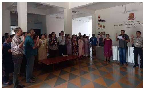
Staff members taking the Vigilance Awareness Week 2024’ Pledge