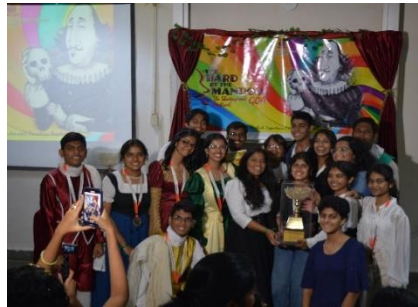
Second Runners up - Loyola HSSC, Margao The Shakespeare Festival