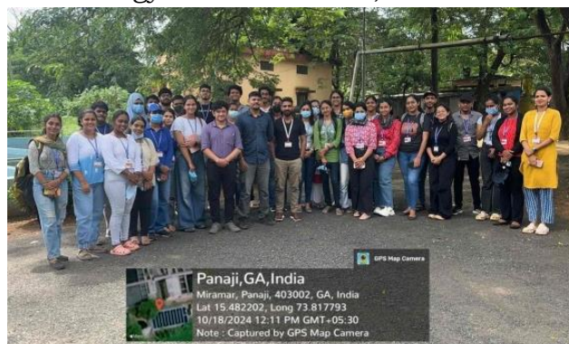
Students and faculty at the Sewage Treatment Plant, Panaji