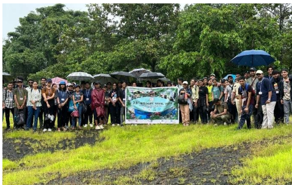
Students and faculty members for the visit to the Netravali Wildlife Sanctuary