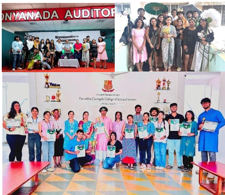
Department of Zoology First Runners-Up 'Wilderness 7.0'

The Department of Zoology of our College team emerged as First Runners-Up in the event and were awarded with a trophy and certificates.