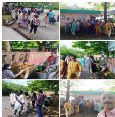
A glimpse of Gandhi Jayanti 2024 Shramadan

The College along with the NSS unit organized a 'Cleanliness Drive' to celebrate Gandhi Jayanti on 2 nd October, 2024. A short ceremony in the Heritage Hall was followed by students and teachers of the college working together to clean the campus and the areas around the college. In doing so, the college emphasized its commitment to a cleaner surrounding and a cleaner nation.