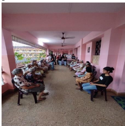
Students at the 'Nazareth Home'