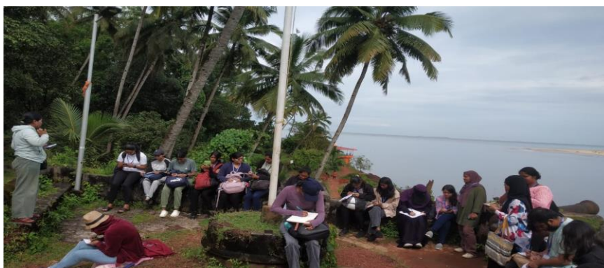
Students for the field trip