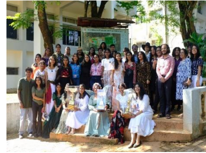
Organizing Team The Shakespeare Festival