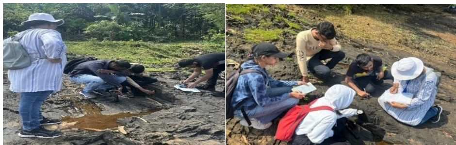
Students for the 'Field Trip and Cleanliness Drive'