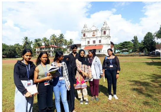
Students for the field work at Curtorim

Field work was organized to understand the water management system and livelihood in Curtorim by the local community on 21 st October, 2024 as a part of the Skill Enchance “PRA Techniques Transect walk and personal interview as the core method to collect information of Social Science (SEC) for the first year. Around 08 students attended the field work where they used Transect walk and personal interview method.