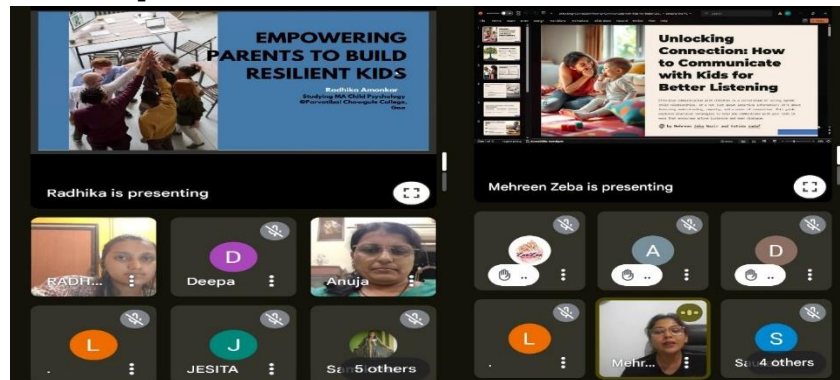
Screenshot of the online workshops

These workshops were designed to psycho-educate parents through audio-visual aids, help parents better understand their child's problems and foster a healthy parent-child relationship. This also helped our students apply the theoretical learning's of the course and gain practical exposure.