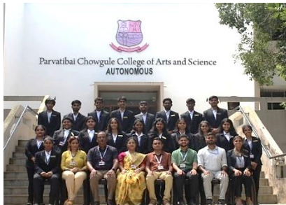
“Advitiya Netrutva” Student Leadership Group 2024-25