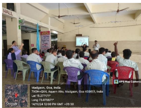
MA Part-II student delivering the session on Surf Smart: Safe Adventures Online'