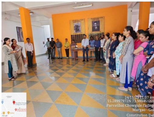
Principal reading the preamble