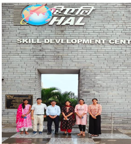
Faculty for the ‘Sixteen Day Training program for Science and Mathematics Faculty’ at IISc, Challakere Campus