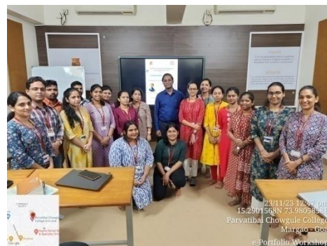
Participants of the workshop on E Portfolio: A New Assessment Tool'

We will come back soon with more highlights of our campus in the upcoming issues. Your comments and suggestions are valuable to us.