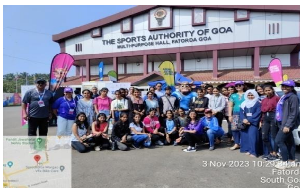
Volunteers from College at 37 th National Games