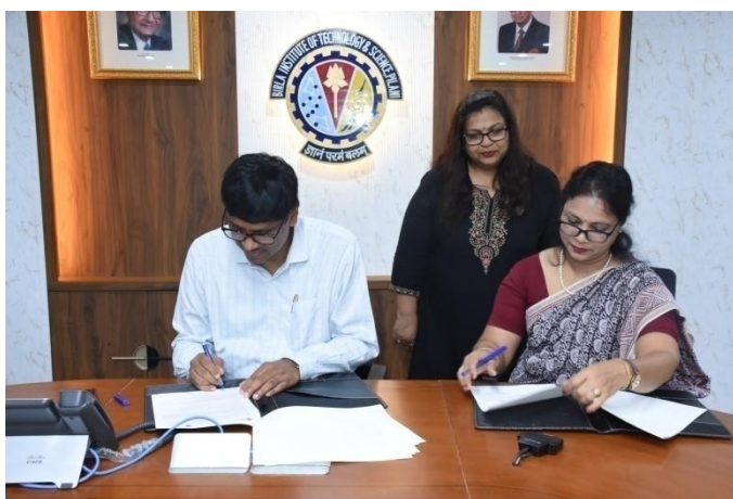
Signing of the Memorandum of Understanding

The MOU intends to have an academic and research collaborations in areas of mutual interest between the institutes. The MOU will lead to collaborative research projects, joint workshops, seminars, students' project work, exchange of academic and scholarly information, publications. It will further explore Academic Bank of Credits transfer. The MOU also holds an opportunity for faculty and students for direct enrollment for PhD Programme at BITS.