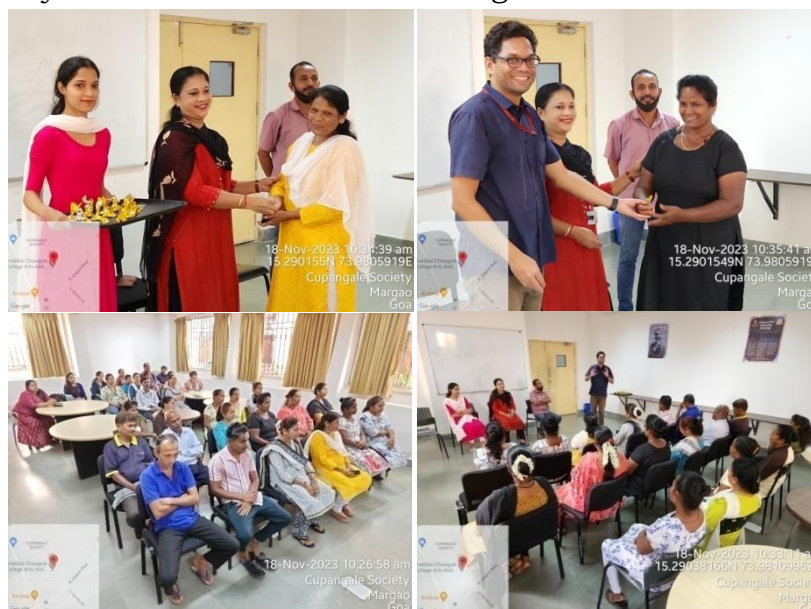
A glimpse of the "Thank You Function for Cleaning and Support Staff"

The support staffs through their hard work and diligence plays an essential role in the smooth functioning of the College. This ceremony was a small token of appreciation on part of the College to thank the support staff for all that they do, behind the scenes on many occasions. It also fosters a communitarian spirit and helps us focus on our goals of educating young minds in a clean and peaceful environment. A total of 15 faculty members and 18 non-teaching staff attended the same.