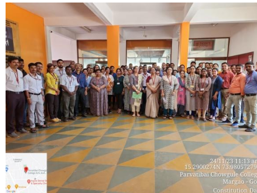
Teaching and Non-teaching staff attending the event