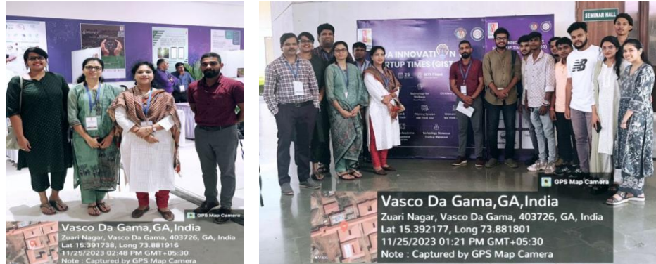
Institution's Innovation Council (IIC) members and students along with the Principal for the 'Goa Innovation and Startup Times' GIST-23 at BITS Pilani, Goa Campus

There were different sessions like Science for Sustainability, Technology for Wellness, IDEathon, Womennovator, Goa Empowerment and Entrepreneurship Track etc. There was also a Technology and Startup Showcase event which exhibited and demonstrated the use of technologies and start-ups.