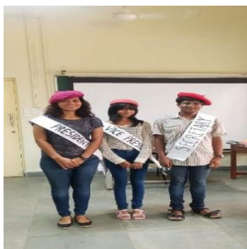
The newly elected member of the of the French Club - The Beret Bunch