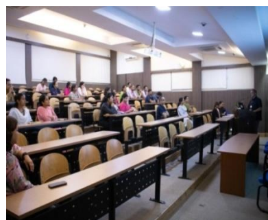
The resource person presenting before the newly appointed faculty members