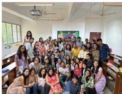
Participants of the 'Genises' event