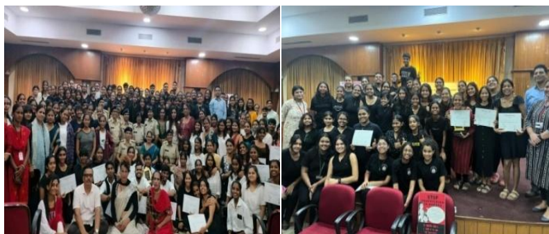
Students at the programme on 'World Day against Human Trafficking 2023'