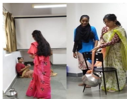
Students performing a drama on 'Thakur Ka Kuwaan'