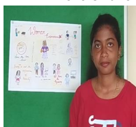
First Place 'Women Empowerment'

The Department organized a Poster Making Competition on the theme 'To Safeguard the Health and Rights of Women and Girls' for the students of the College. The Poster competition sub-themes were a) Women Health b) Women & Education c) Women & Society d) Women Empowerment. A total of 8 students participated in the same. The winners of the competition are as mentioned below: