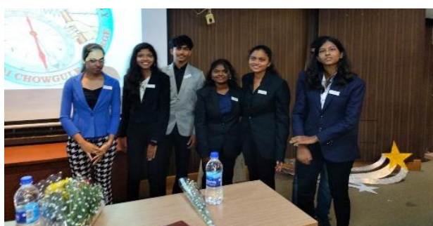
Newly inducted office bearers 2023-24 of Club Nebulites