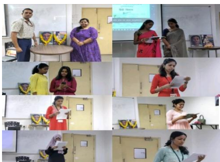
A glimpse of Paper Presentation by students