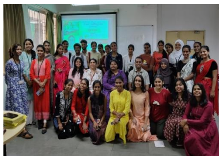
Participants of 'Goswami Tulsidas Evam Premchand Jayanti'