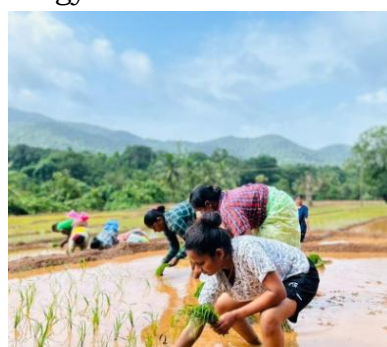
Students helping the farmers sow the crop