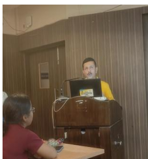
The resource persons delivering the session on 'Protection and Management of Intellectual Property Rights'