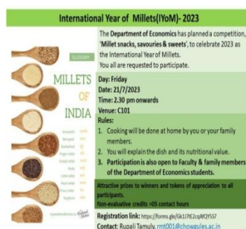
Poster of the 'Millet Snacks, Savouries &amp; Sweets' Competition