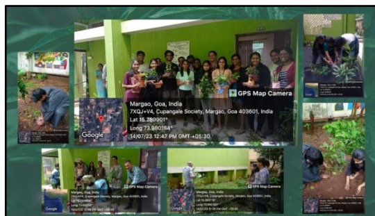
A glimpse of the tree plantation drive