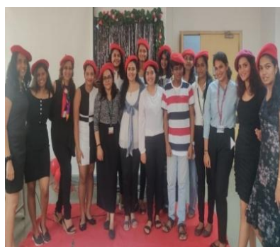
Students along with the faculty