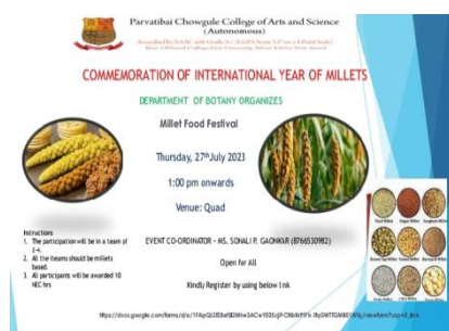
Poster of the event 'Millet Food Festival'

Millet-based foods were displayed by the students, where each student explained the benefits of the dish they prepared. The Government of India has identified millet as a safe bet to enhance farmer's income and as a reliable grain to ensure India's nutritional and food security. The activity ensured that the students get to know about the importance and benefits of millets in a tasty and a healthy way. A total of 15 students displayed millet-based foods.