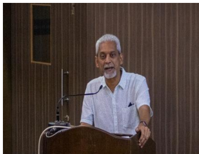
The resource person Dr. Vikram Patel delivering the talk on 'Sangath Journey in Mental Health'