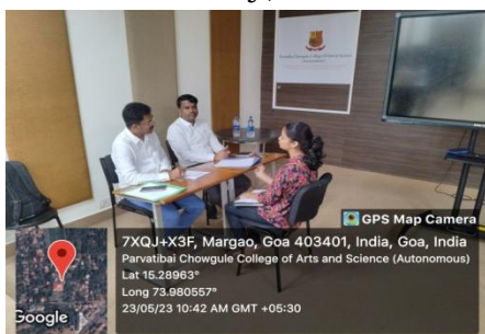
CIPLA recruitment team interviewing a student