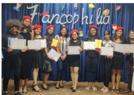
Students along with the faculty for the 'Francophilia' event