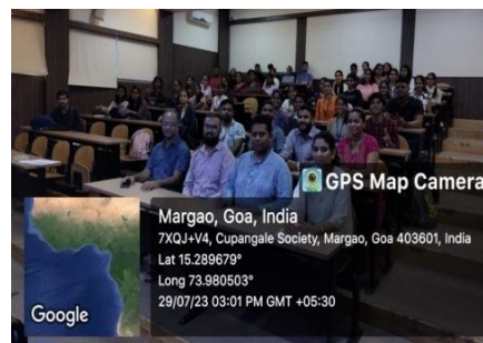
Participants of the talk on 'Career Opportunities after Graduation'