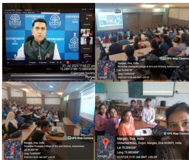
Live interaction on 'Apprenticeship Training Scheme for Apprentices of Goan Youth', broadcasted in the College

The 'Live interaction on Apprenticeship Training Scheme for Apprentices of Goan Youth' was broadcasted in Parvatibai Chowgule College of Arts and Science, Autonomous on 1 st July, 2023. It was organized by Directorate of Planning, Statistics and Evaluation, Government of Goa. The honourable Chief Minister of Goa Shri. Pramod Sawant presided and addressed Swayampurna Mitras, Taluka Nodal Officers and aspiring youth from Village Panchayats and Municipalities. The Directorate of Skill Development & Entrepreneurship informed the audience about the Apprenticeship Training Scheme and other beneficiary-oriented schemes of the Directorate. Two beneficiaries spoke about their success with the programme. A total of 113 students and 4 faculty attended the same.