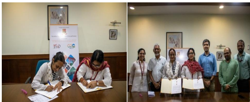
Signing of the Memorandum of Understanding