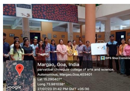
Participants of the event 'Millet Food Festival' along with Offg. Principal and faculty