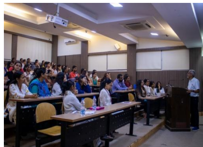
Participants of the talk on 'Sangath Journey in Mental Health'