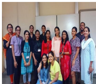
Participants of the 'Millet Snacks, Savouries &amp; Sweets' Competition