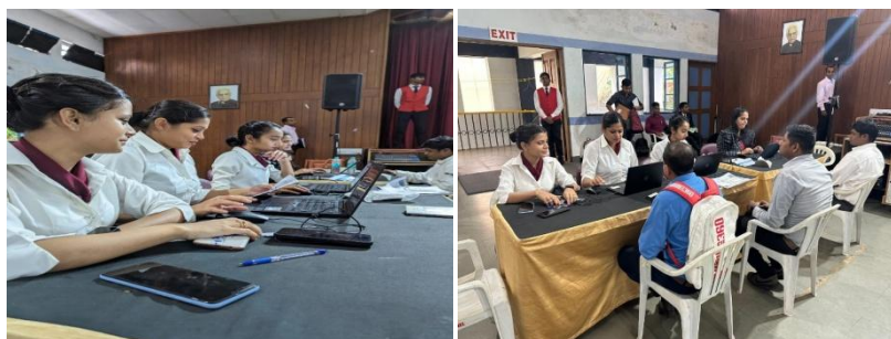
Students performing their assigned responsibilities