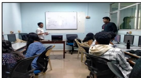
Students of MSc in Information Technology Part-II conducting the workshop on 'Basics of Python Programming'