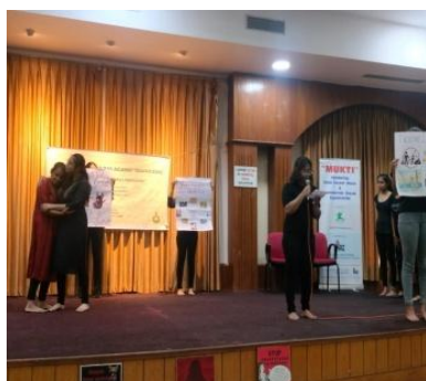
Students performing to raise awareness on human trafficking