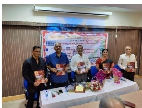
Release of the Souvenir 'Phir Miley'

The reunion was an excellent opportunity to reconnect and network with fellow alumni to share their experiences and achievement