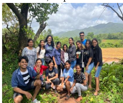
Participants of the 'experiential learning trip'