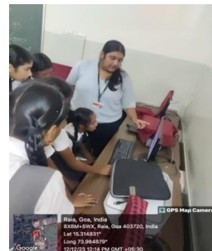
Hands-on-sessions with the school children