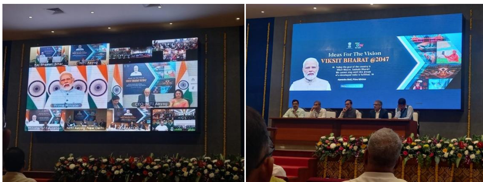
Snapshot of the event