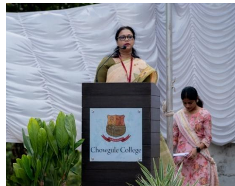
Principal unfluring the National Flag(left) and addressing the gathering (right)