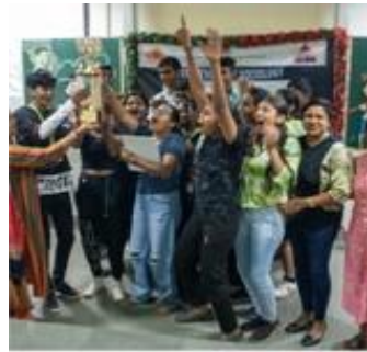
Runners-up St. Alex Higher HSS, Curtorim