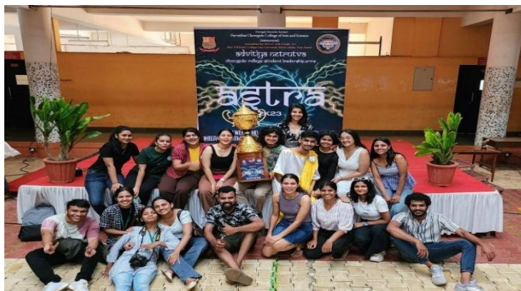
Winners 'ASTRA 2K23!'