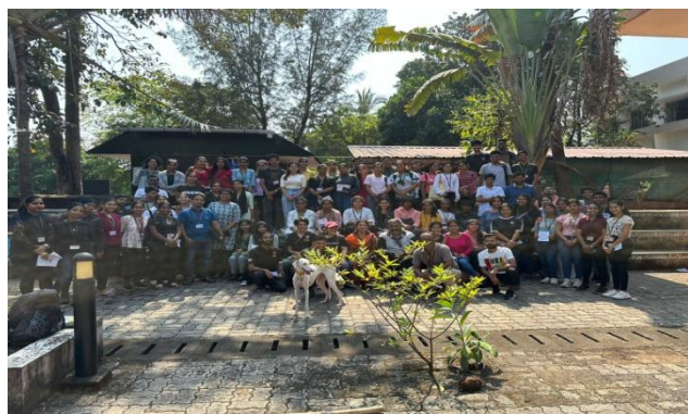
Participants of the 'All Dogs Matter'