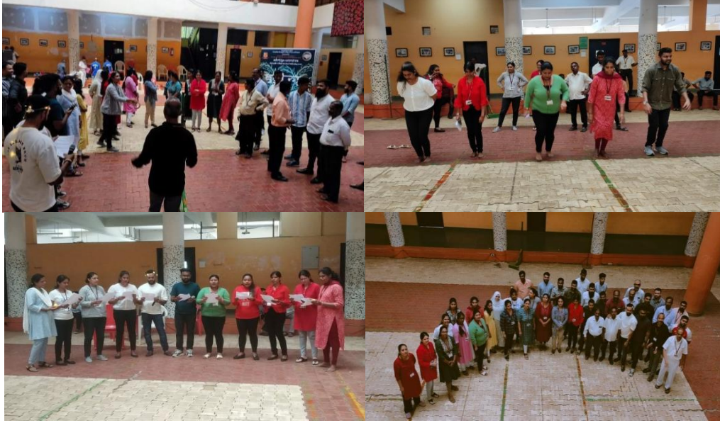
A glimpse of the 'Get-together'