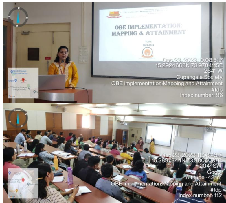
Faculty members delivering the session on "OBE Mapping & Attainment"

We will come back soon with more highlights of our campus in the upcoming issues. Your comments and suggestions are valuable to us. Email: principal@chowgules.ac.in