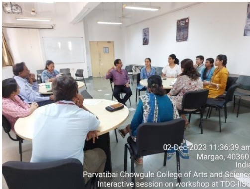
The faculty members sharing the learning's and experience of the workshop