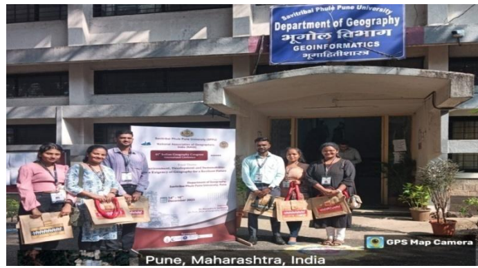
Faculty and students for the 45 th Indian Geography Congress International Conference of the National Association of Geographers, India (NAGI)