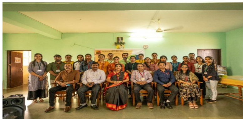
Principal, Vice-Principal, College faculty members and students along with the Sarpanch, Panchayat Secretary, at Camorlim Village Panchayat