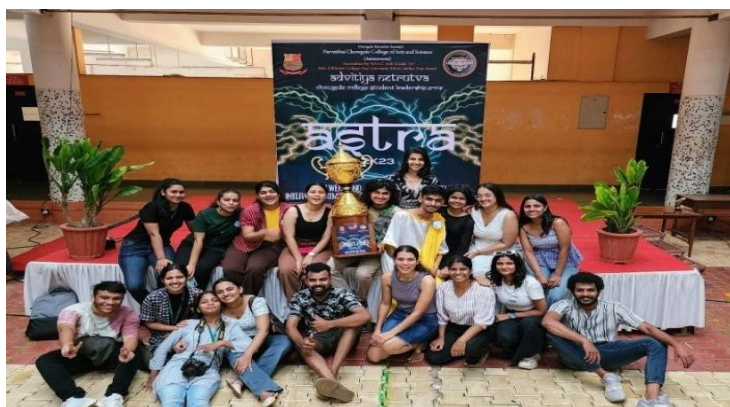
Winners 'ASTRA 2K23'