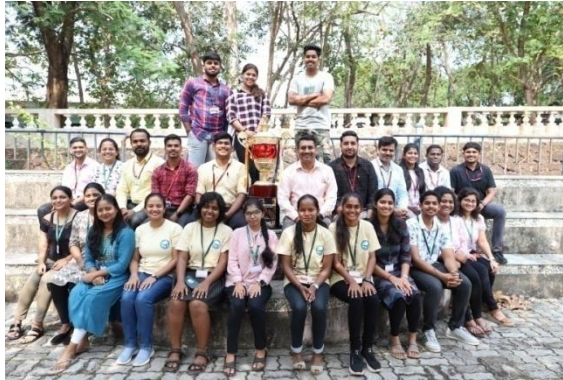
Overall Champions Inter-Departmental Multisport Tournament 2022-23 Tiger Sports Feista