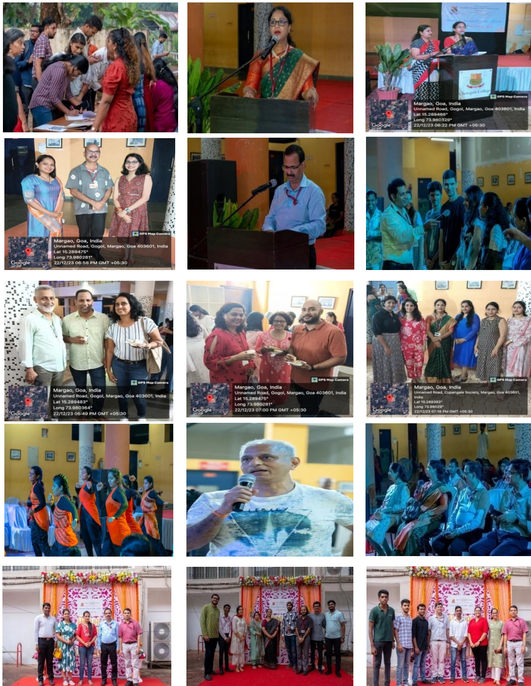
A glimpse of the Alumni Meet 2023

Chowgule Education Society's, Parvatibai Chowgule College of Arts and Science (Autonomous) welcomed a spirited gathering of alumni on 22 nd December, 2023 from 5:30 p.m. to 8:00 p.m. for a memorable evening filled with nostalgia, rekindled friendships and a celebration of shared experiences. The Meet provided a platform for interactive sessions, allowing former students to share their professional journeys and achievements.