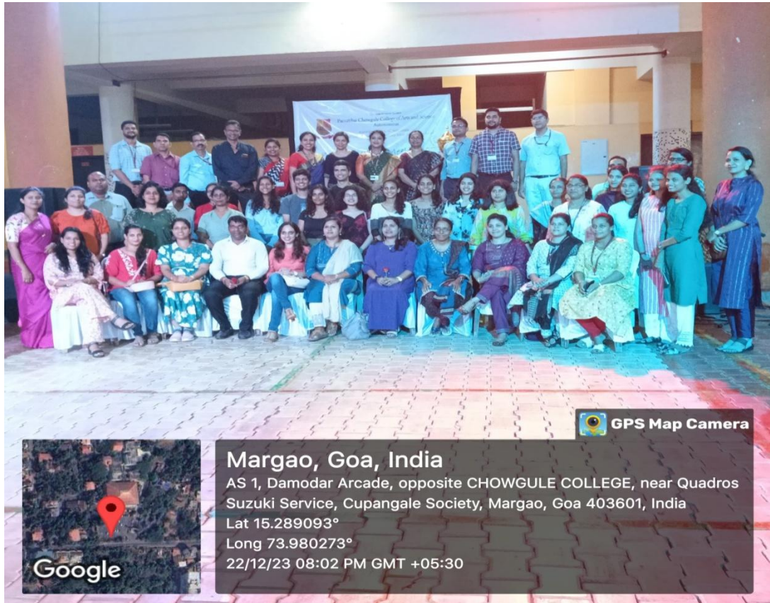
Alumni Meet 2023