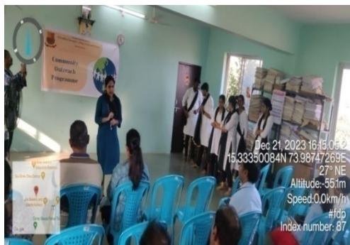
Awareness programme on Financial Literacy

The programme scheduled from 12 th December 2023 to February 2024 is a collaborative effort with the Camorlim Village Panchayat.