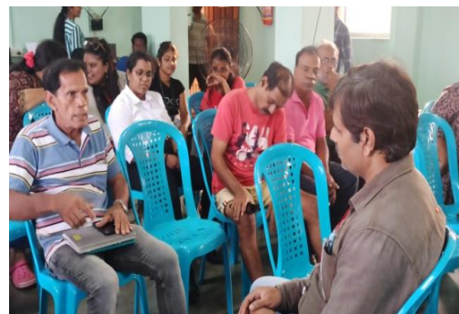
Soil Testing and Water Testing Awareness for Farmers