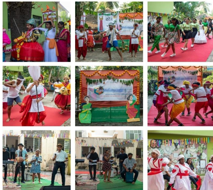
A glimpse of the events