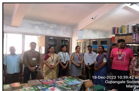
A Book Exhibition featuring a Kaleidoscope of 'Books on Goa'