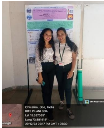
Students at the One-Day Seminar on ‘Recent Advances in Bio-Inorganic Chemistry’