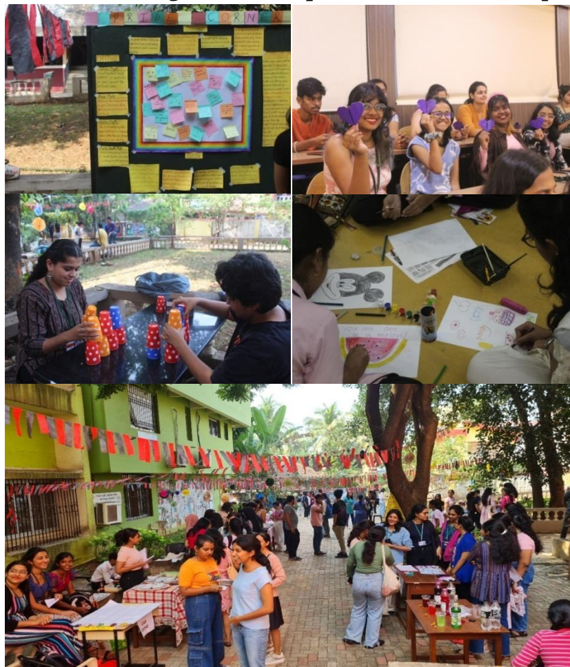
A glimpse of the 'Youth Mental Health Festival'