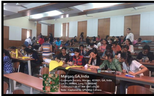
Students engaging in a team building activity administered during the workshop