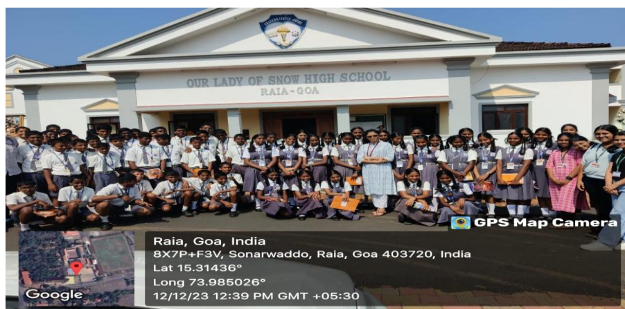
Students and IIC Members for the 'Innovation & Entrepreneurship Outreach Program' at Our Lady of Snow High School, Raia