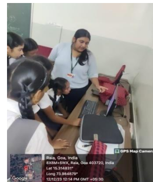
Hands-on-sessions with the school children