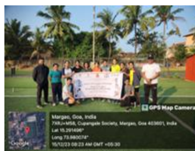
Fit India Week Closing Day