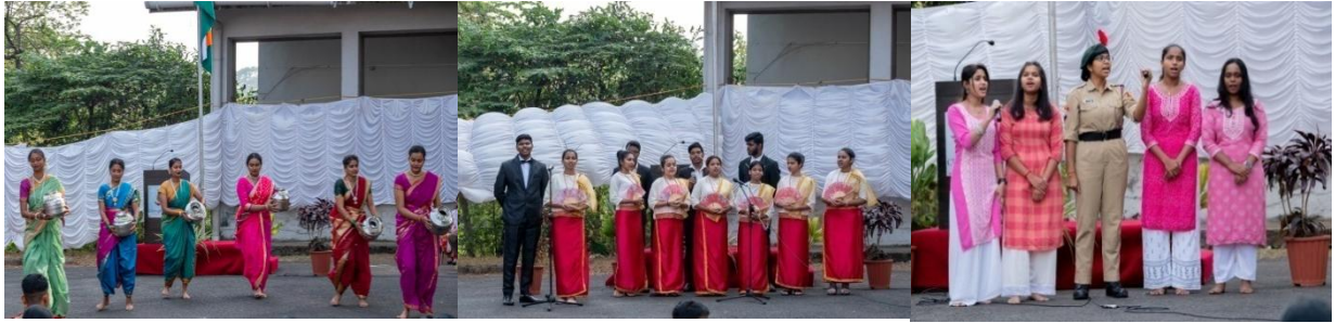
A glimpse of the cultural events