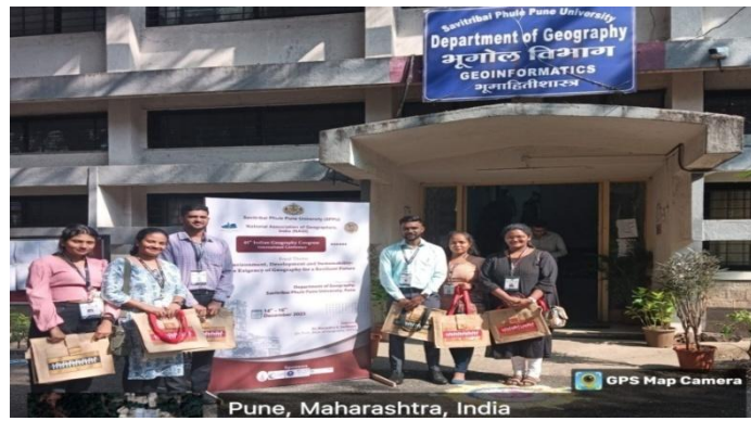
Faculty and students for the 45 th Indian Geography Congress International Conference of the National Association of Geographers, India (NAGI)