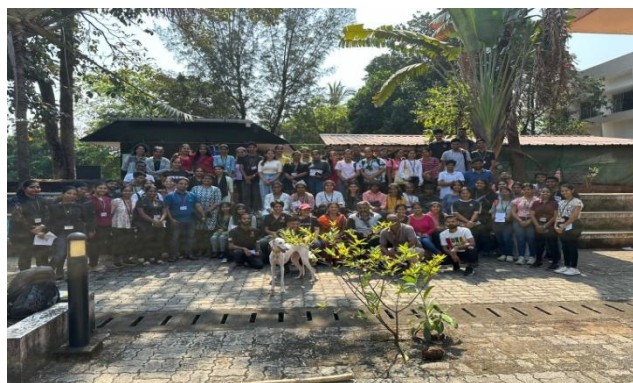
Participants of the 'All Dogs Matter'