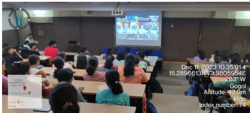
Snapshot of the session on 'Viksit Bharat@2047 Utsav'

The inaugural address was given by Hon'ble Prime Minister of India Shri. Narendra Modi. Prime Minister emphasized that the youth, who constitute our largest population group has a huge role here as they will lead India to Viksit Bharat by 2047. A total of 74 students and 6 faculty members attended the session.