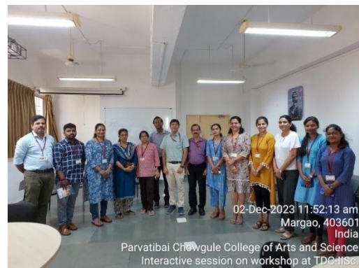
Participants of the 'Interactive Session–Ghazali Series'