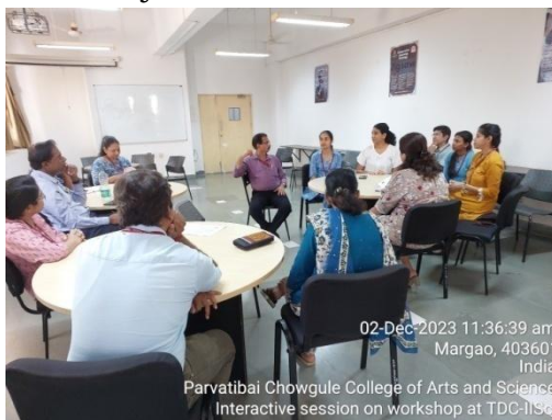
The faculty members sharing the learning's and experience of the workshop