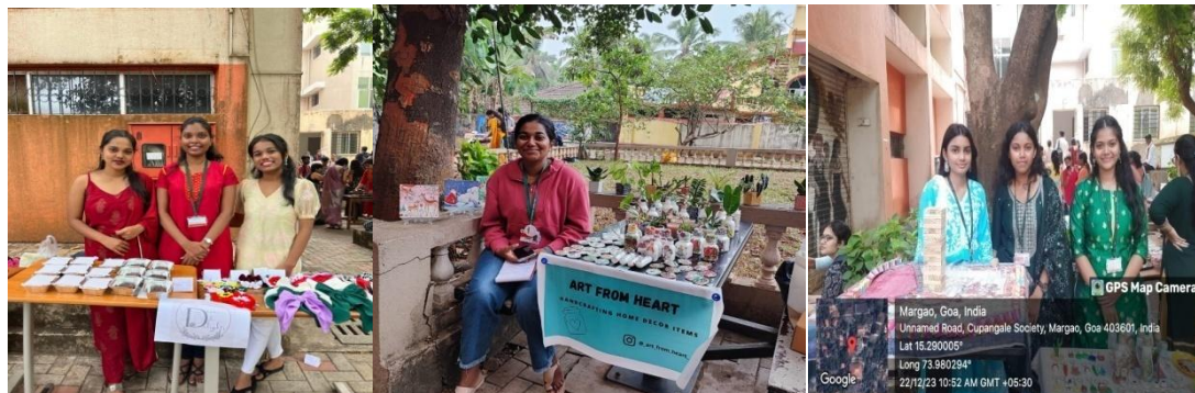
A glimpse of the 'Pop Up Bazaar'