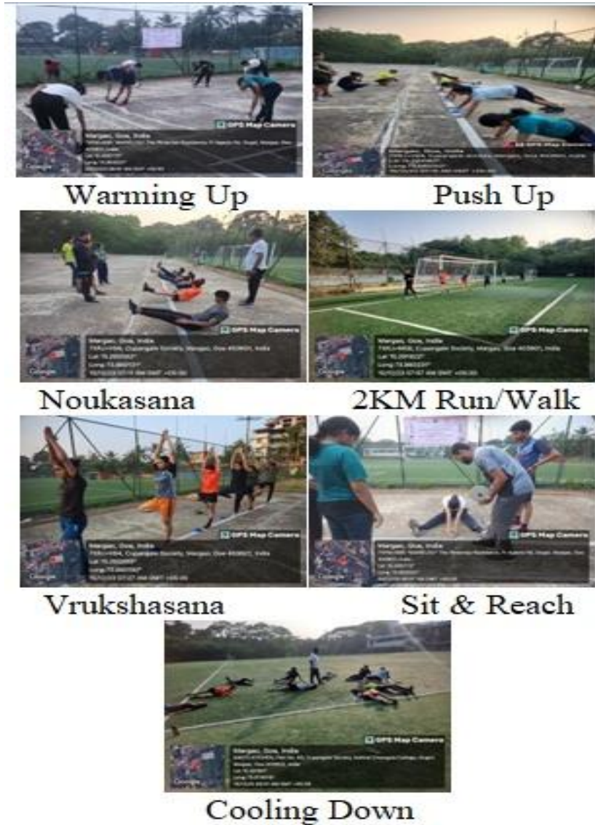
A glimpse of the events