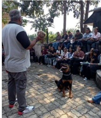
Member of Give Goa Dogs showing how to train a dog