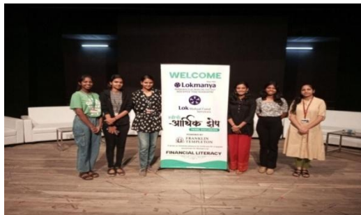
Students for the 'Streechi Asthik Zhep Womens Financial Literacy' panel discussion