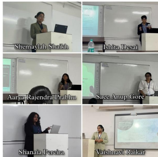
Students presenting the research papers for the 48 th All India Sociology Conference on the theme 'The Crises of the 21 st Century and the Way Forward'