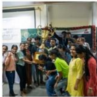
Winners S.S. Angle HSS, Canacona