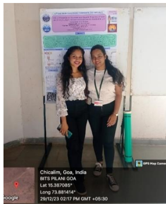
Students at the One-Day Seminar on ‘Recent Advances in Bio-Inorganic Chemistry’