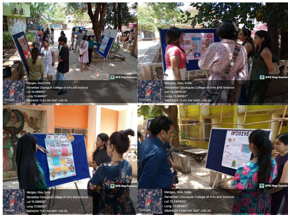
A glimpse of display of posters on 'Understanding Substance Addiction'