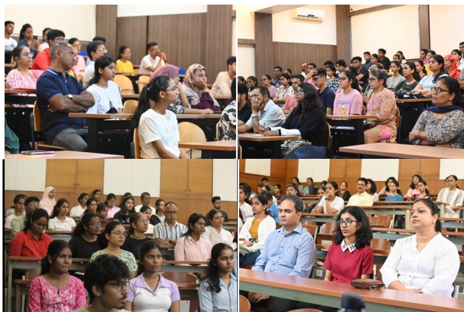
Parents and Students for the 'Open Day / Education Expo 2024-25'

A total of 139 participants out of which 82 were in Arts and 57 in Science attended the event.