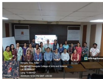
Participants along with the resource person