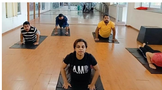
Suryanamaskar Session organized for teaching and non-teaching staff of Department of Geography