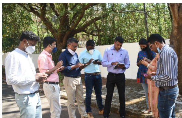
Participants during the on-field session of the QGIS Training Programme