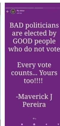
Slogans shared on social media by students