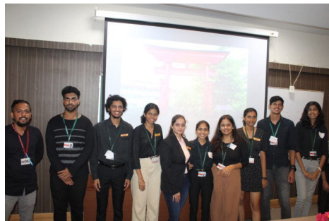
Organising Team of ECO VISION 2022

The various competitions held included: 1) Poster Making, 2) Photography, 3) Selfie Competition, 4) Quiz, 5) Street Play, 6) Treasure Hunt and 7) Stand-up Comedy. The themes and topics for the various events were based on the overall main theme.