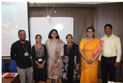
Faculty members and Guests.

https://instagram.com/doe_official?igshid=1t3sbs8ktl7gj