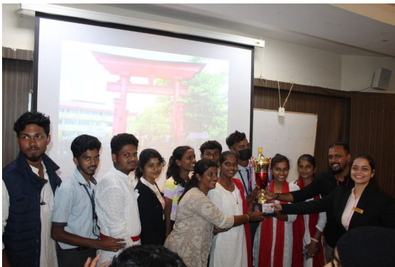
Eco Vision: Winners.