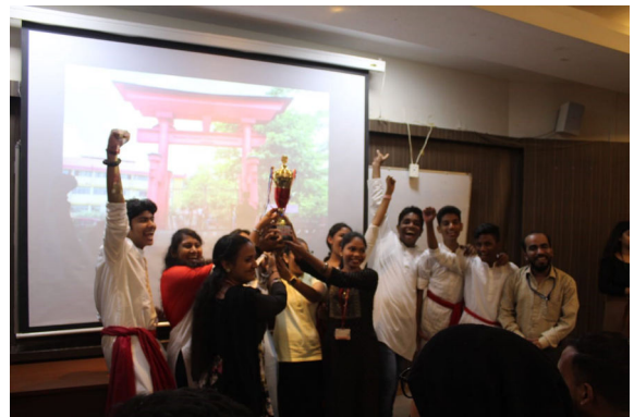
Eco Vision: Runner Ups.