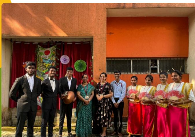
Group photograph of the Mando participants with the faculty.