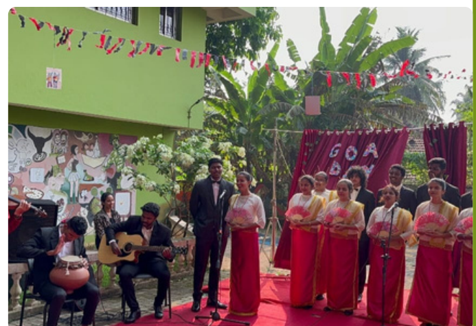
Students performing the Mando.