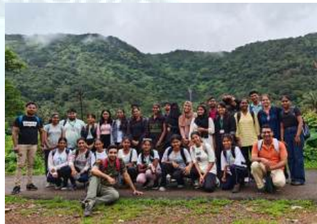
Students and Faculty for the Monsoon Trek to Kushke waterfalls, Canacona - Goa