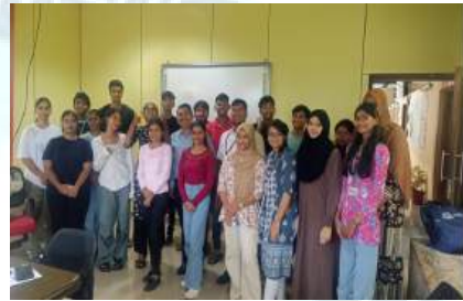
Students Attending the workshop

The first part of the workshop was theoretical where she explained the elements of map making i.e. legend, title, scale, direction etc. The second part of the workshop was demonstrative. He showcased different tools for data presentation i.e. excel, map making, color brewer. Etc. The students were demonstrated step wise use color brewer 2.0 for creating cartographic maps.