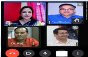
Screenshot of online session