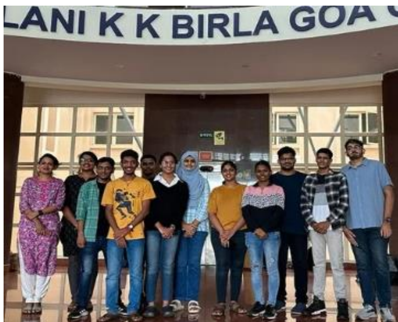
Figure 15 : Faculty and Second year student at the BITs Pilani Birla Goa Campus.