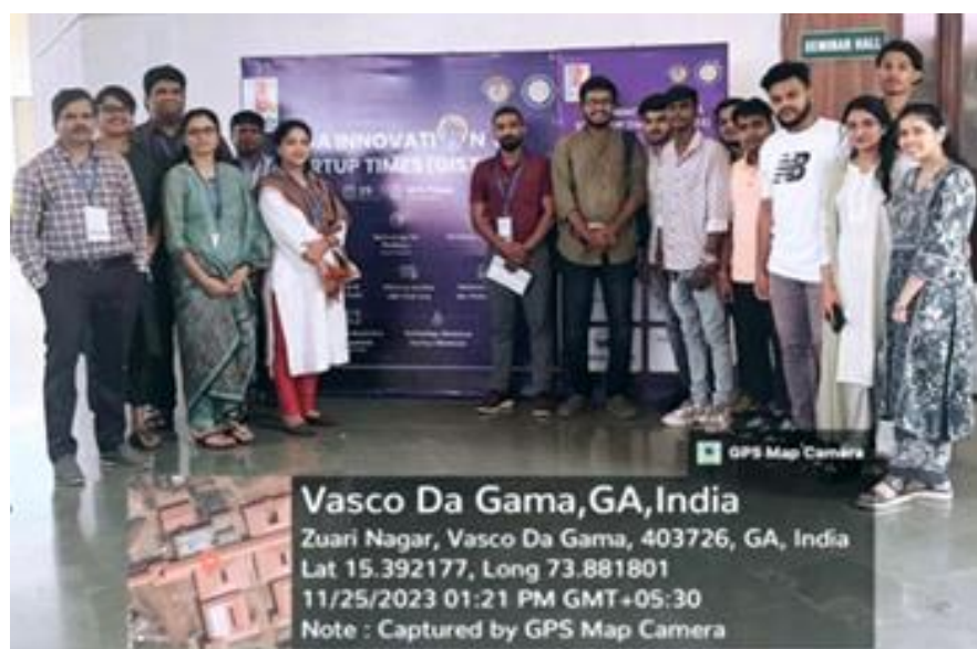
Figure 03 : Institution's Innovation Council (IIC) members and students along with the Principal for the 'Goa Innovation and Startup Times' GIST-23 at BITS Pilani, Goa Campus