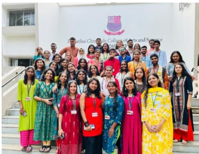
Figure 21 : The Students who attended and organizers of the 'International year Of the Millets (IYoM) - State Level Seminar