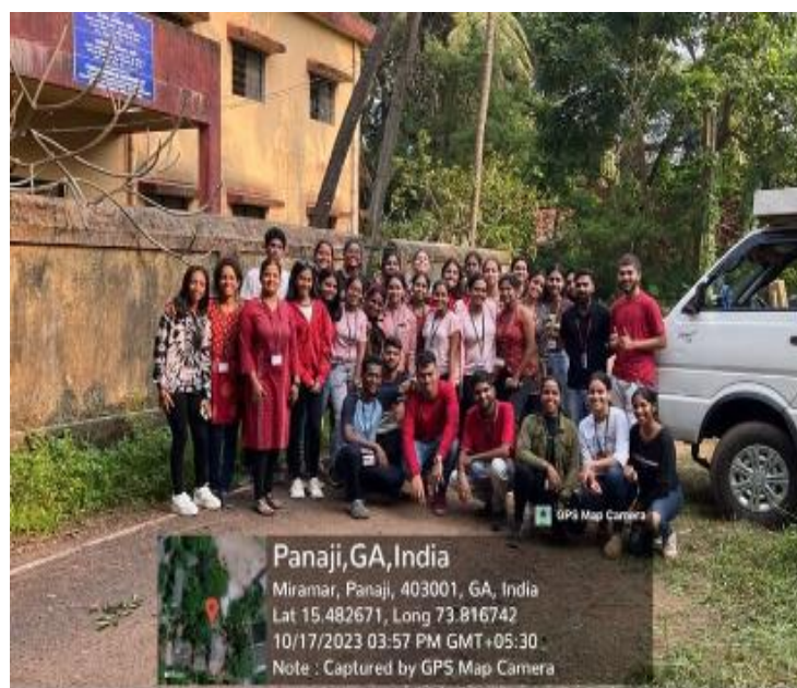
Figure 16 :Faculty and Final year students field visit to Sewage Treatment Plant, Tonca.