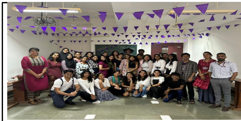
Figure 18 : Newly joined first years with the faculty

Back into the 80s and 90s, A freshers party was organized on the 21st of July 2023 for the newly joined First years. There were many performances exhibited and games to inculcate fun learning during the event.