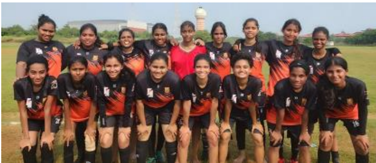
Figure 14 : Students of the department as the members of the college's women football team