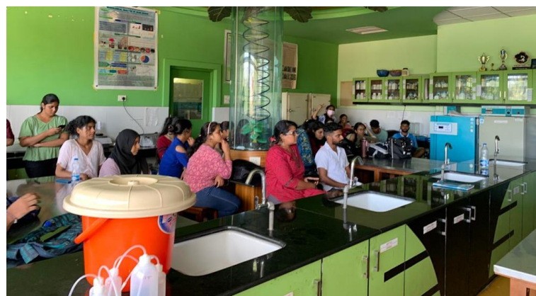
Figure 20 : Inter-house debate competition