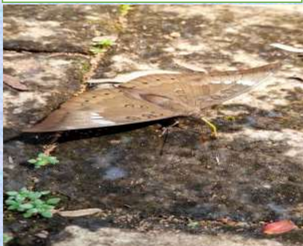
3 rd place Image caption: Flying high but grounded