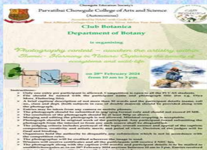
Photography Contest flyer