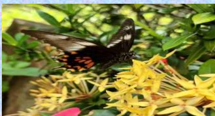
2nd place Image caption: Amber dance