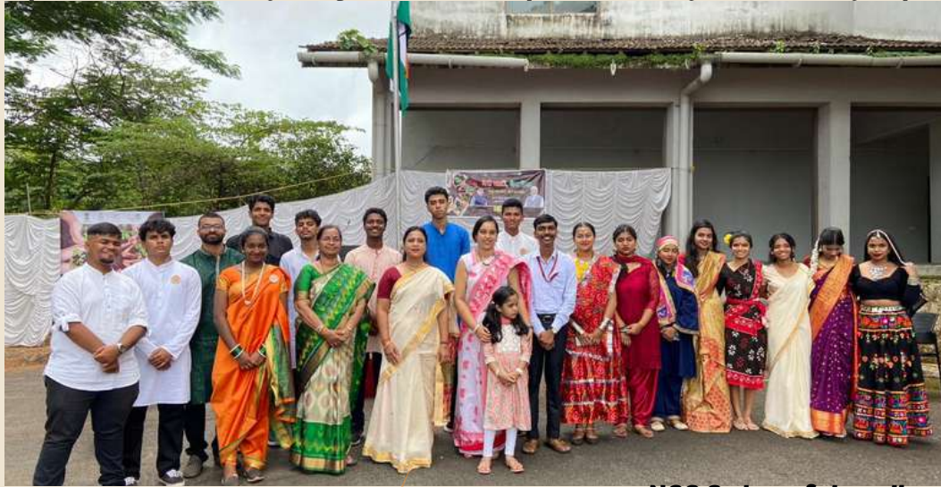
NCC Cadets of the college attending the flag hoisting

Student performers of the day along with the Principal and Faculty of the History Department.