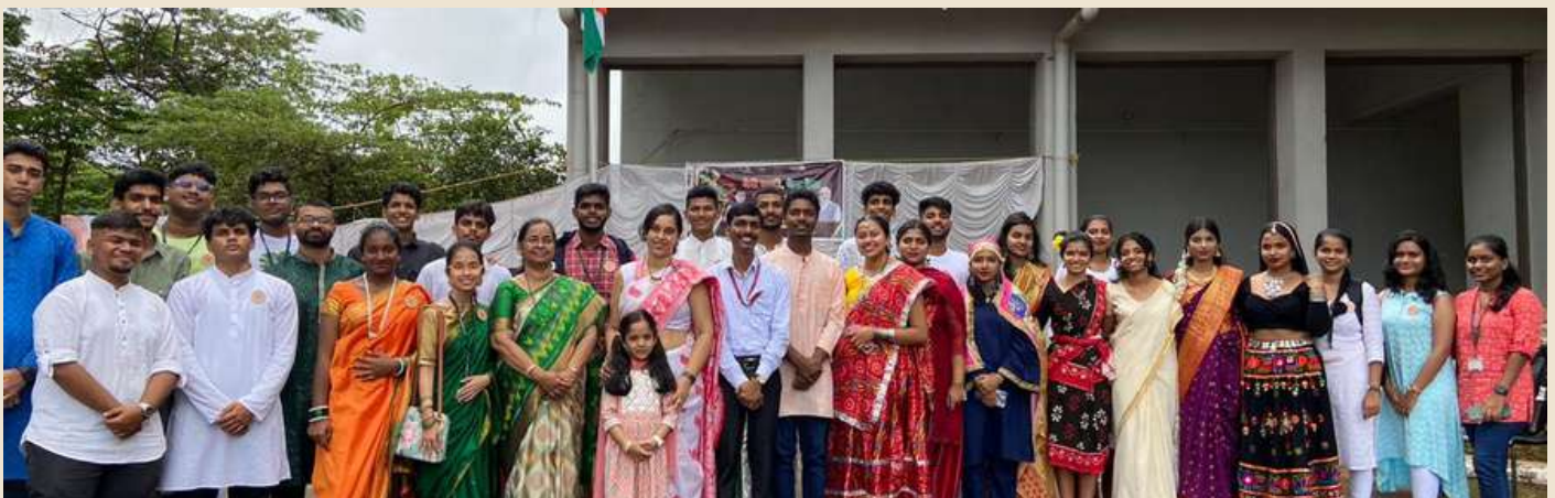
Group photograph of the students along with the Faculty.