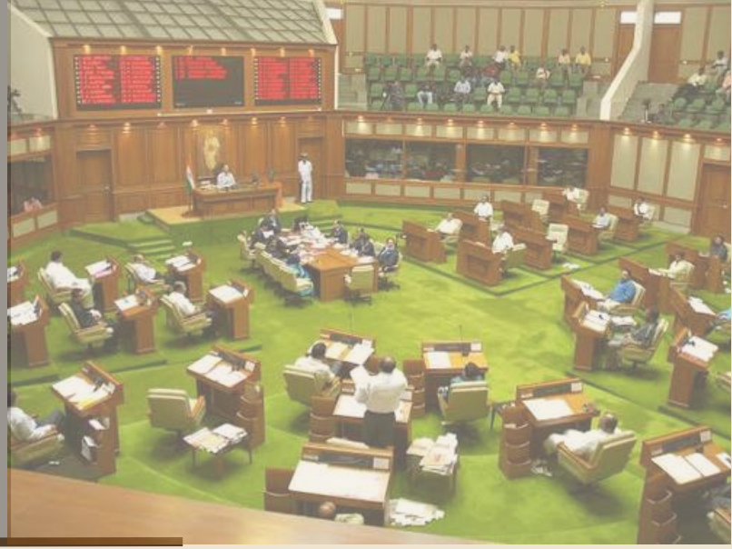
Group photograph of the students along with the faculty, watching the proceedings of the Assembly.