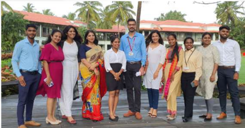
Faculty and Students of M.A. Part II Geography at ITC Grand Resort and Spa, Arossim-Goa