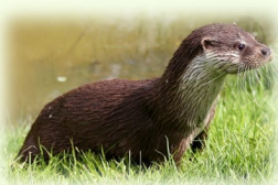
Smooth-coated otter ( Lutrogale perspicillata )

Goa is a home to two species of otters: The smooth-coated otter ( Lutrogale perspicillata ) found in the estuarine habitat and the Asian small-clawed otter ( Aonyx cinereus ) found in the freshwater streams of Western Ghats.