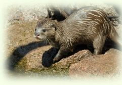
Asian small-clawed otter ( Aonyx cinereus )